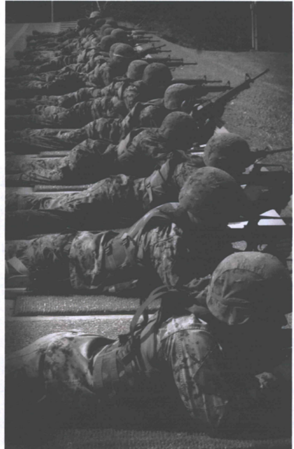
Marines at Camp Hansen.

whether their stockpile of 21,581 small arms – defined as including pistols, machine guns and rocket launchers – was correctly stored.