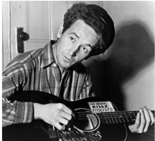
Woody with guitar labeled “this machine kills fascists”, 1943.

Throughout the 1930s, Woody opposed American involvement in World War II, writing and performing numerous antiwar songs that excoriated Franklin Roosevelt as a duplicitous warmonger. His view shifted after 1941 when Hitler broke the 1939 Molotov-Ribbentrop non-aggression pact and replicated Napoleon’s folly by attacking Russia which then joined forces with the Western allies to fight fascism. 2 With the U.S. in the war after Pearl Harbor, Woody began penning songs like “Lindbergh,” which excoriated the isolationists and America First, though another of his songs expressed a secret desire for all the soldiers “on every single side” to “take off [their] helmet, unbuckle [their] kit, lay down [their] rifle ...and say, nope, I ain’t gonna kill nobody.” 3