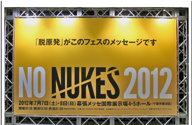
The Entrance to the Concert

On July 7-8, 2012, a two-day mass rock concert called No Nukes 2012 was held in the Makuhari Messe Convention Center in Chiba, near Tokyo. The organizer was Sakamoto Ryuichi , member of the groundbreaking Japanese technopop group Yellow Magic Orchestra (YMO) and Academy Award-winning composer. Profits from the concert were donated to Sayonara Genpatsu 1000 Man Nin Akushon (Citizens' Committee for the 10 Million People's Petition to say Goodbye to Nuclear Power Plants), an antinuclear group which Sakamoto has been backing, along with Nobel Prize-winning author Oe Kenzaburo and others. The concert featured performances by 18 groups, including pioneering electronic groups Kraftwerk and YMO as well as rock bands Asian Kung-Fu Generation, Acidman, and others.