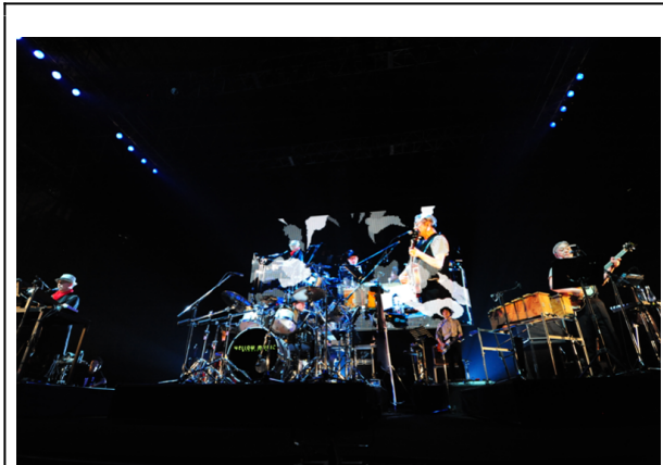
Yellow Magic Orchestra at No Nukes 2012

YMO also played their own version of "Radioactivity" and showed visuals with the words, "No Nukes / Yes Life/ More Trees."