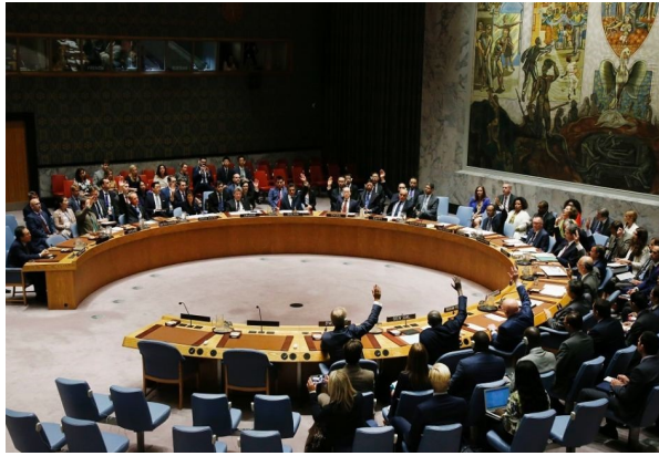
UN Security Council, Voting Sanctions on North Korea, September 2017

As for Australia, Prime Minister Malcolm Turnbull declared on radio that “In terms of defence we are joined at the hip” and it would promptly join if needed for any resumption of the Korean War. 39 He later added, as if seeking approval in Washington and Tokyo, reference to the government of North Korea as “a criminal organization operating under the guise of a state.” 40 Even after the adoption of the September package of sanctions and the abusive Trump UN speech, Foreign Minister Julie Bishop opined, that “I believe there is more we can do in exerting political, diplomatic and economic pressure on North Korea.” 41 She favoured “autonomous sanctions” that went beyond the UN-ordered ones. 42 An example soon arose. Australia refused visas to an under-19 North Korean soccer team to compete in the Asian Football Federation championships. “Hosting the team,” said Foreign Minister Bishop, “would be contrary to the government’s strong opposition to North Korea’s illegal nuclear and missile development programs.” 43 It was precisely the sort of collective punishment principle against which, rightly, Australia might take exception when practiced by North Korea. No politician or public figure in Australia had any word to say on behalf of the North Korean under-19s.