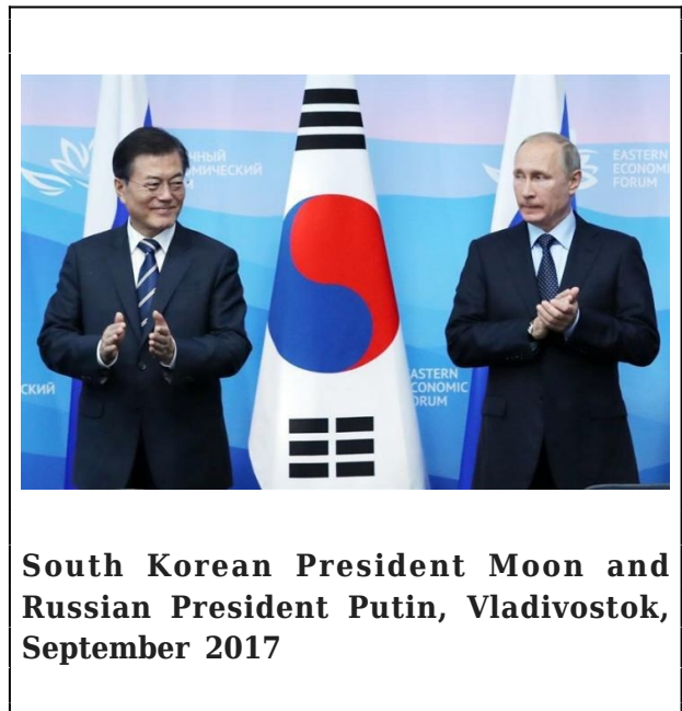
South Korean President Moon and Russian President Putin, Vladivostok, September 2017

Currently “on the table” in regard to the “North Korea problem,” are two contrasting proposals: the US-Japan-Australia (perhaps joined by India) demand for unconditional North Korean submission and the Russian-Chinese proposal (for the most part shared by South Korea), condemning the North Korean missile and nuclear tests but urging “three Nos” to freeze the existing status quo, taking steps to defuse tensions, respect the DPRK’s “justified concerns” and create a peninsular “peace and security mechanism.” 62 The former has no vision for the region other than to shore up US hegemony but the latter does, and it is a bold and ambitious one.