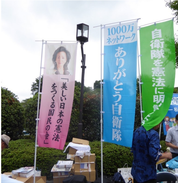
The flags at the booth of the Association to Create a Beautiful Constitution for Japan in front of Yasukuni Shrine on August 15, 2017.