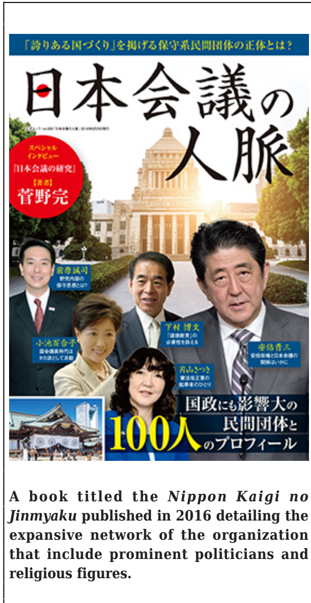
A book titled the Nippon Kaigi no Jinmyaku published in 2016 detailing the expansive network of the organization that include prominent politicians and religious figures.

Japanese political lobby, with deep ties to Prime Minister Abe and the ruling Liberal Democratic Party.