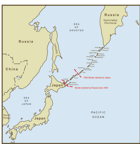
Map of the Kuril Island chain detailing pre-and post-WWII boundaries.