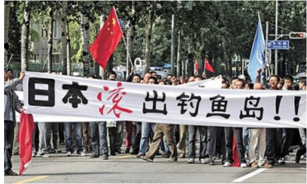
Chinese demonstrators on September 18, 2010 at the Japanese Embassy in Beijing

In this fashion, the Bao-Diao Movement in the Chinese sphere has risen and fallen, to rise again, in response to developments of recent history. One wonders how clearly the ruling Democratic Party of Japan understands this background and prevailing conditions.