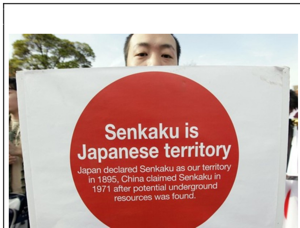
A Japanese demonstrator in a December 2010 Tokyo demonstration