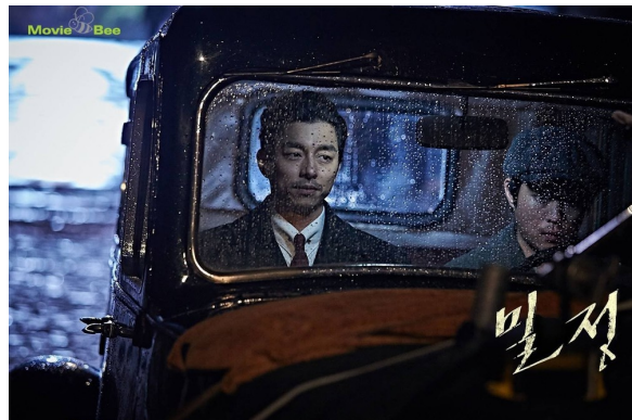
Kim U-chin (Kong Yu) in The Age of Shadows .

The Last Princess makes a notable attempt to engage with the question of working class oppression and poverty in the Japanese empire, unlike the other three films. A thread throughout the film is the terrible conditions of