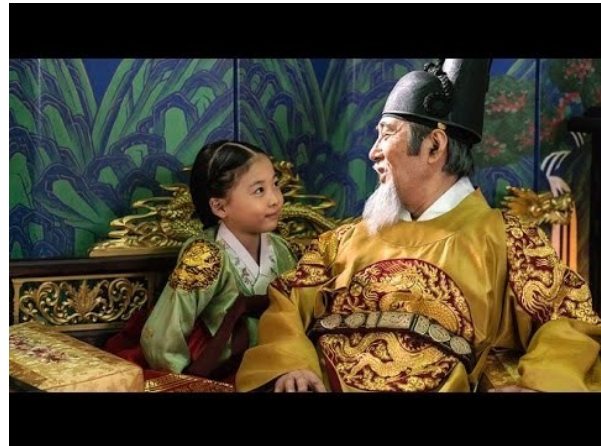
A young Princess Dōkhye (Shin Rin-a) with her father, Emperor Gojong (Paek Yun-sik), in The Last Princess .

With an unbroken linear trajectory moving from the Provisional Government to the present Republic of Korea operative in these films, only a limited, state authorized historical connection is established with the colonial period. On the popular level, no such correlation can be made beyond the auspices of the provisional government. To reiterate why finding such a correlation is necessary, the reader will recall my claim at the outset that the Cold War division of the Korean peninsula risks naturalization if the historical continuities between the colonial period and after are denied. If only an officially sanctioned connection is permitted, Cold War South Korea becomes the teleological culmination of a very limited faction within the Korean independence movement which scarcely conveys its true plurality and diversity of opinions and strategies. According to this teleological view, the militant tactics employed in the movement are no longer warranted after independence. Militant resistance is only recuperated by these contemporary films because it can be subsumed retroactively, via the aforementioned teleology, within the contemporary state's "monopoly on the legitimate use of force," as Weber would say. The logic of violence in these