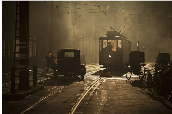
A still from the Shanghai set in Assassination .

colonies, for example in the eerie dens of Shanghai, the nighttime street scene after An Ok-yun and her team arrive in a chilly Seoul, and the emerald and gold brilliance of the Mitsukoshi department store, site of the lavish wedding turned gratuitous gunfight later in the film.