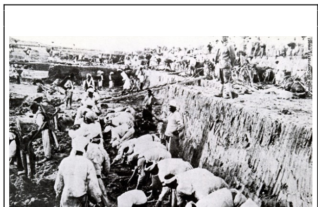
Colonial Korean labor under Japanese supervision.

locomotive, and automobile. One could do a frame-by-frame comparison between, say, the city streets and Japanese/South Korean militaries treated in Modern Boy and Pak Su-jin's Ode to My Father (Kukjae sijang, 2014), respectively, to illustrate the contiguous underlying sensibilities between contemporary blockbuster films treating the colonial period and postliberation South Korea. This presents a curious "return of the repressed," as it were, insofar as a certain continuity with the colonial period - which I have been claiming is otherwise denied in these films - becomes apparent on the level of consumer culture, exhibiting the same commitment to capitalist development (minus explicit reference to its concomitant inequalities) shared by the Japanese colonial project and the postliberation South Korean state. That these two may possibly share the same draconian approaches to governmentality, however, is inadmissible; hence the abandonment of this cultural or economic continuity on the level of politics as represented explicitly in the films. But the superficial manner in which the Japanese colonial project is taboo in these films should be sufficient to trouble any easy conflation of the Cold War division system and true democracy or liberation.