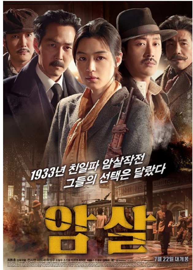
Promotional poster for Modern Boy . The tagline reads, “Independence or collaboration, why bother? The incarnation of romance, isn’t he fabulous?!”