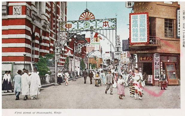
Color postcard of a commercial street in Honmachi, Keijō. Compare with fig. 1. left.