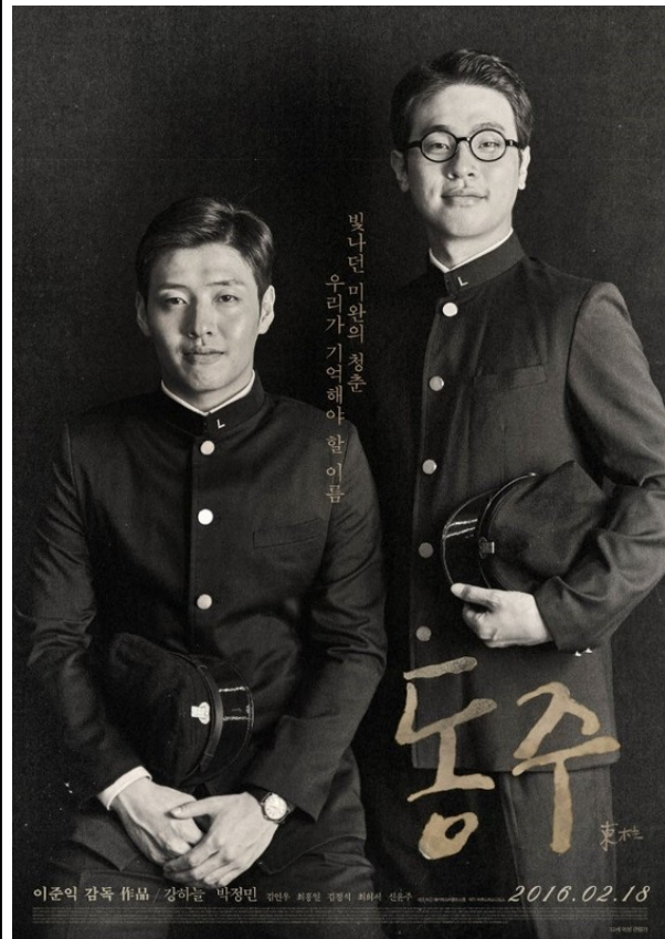
Promotional poster for Tongju .

case, my selection of these four blockbusters is not intended to be entirely representative of South Korea’s collective memory of the colonial period. Instead, I understand these action dramas as one prominent tendency, given their commercial success and circulation, within the vast and complex terrain of historical memory available to representation, one which surely raises the stakes of recollecting the past.