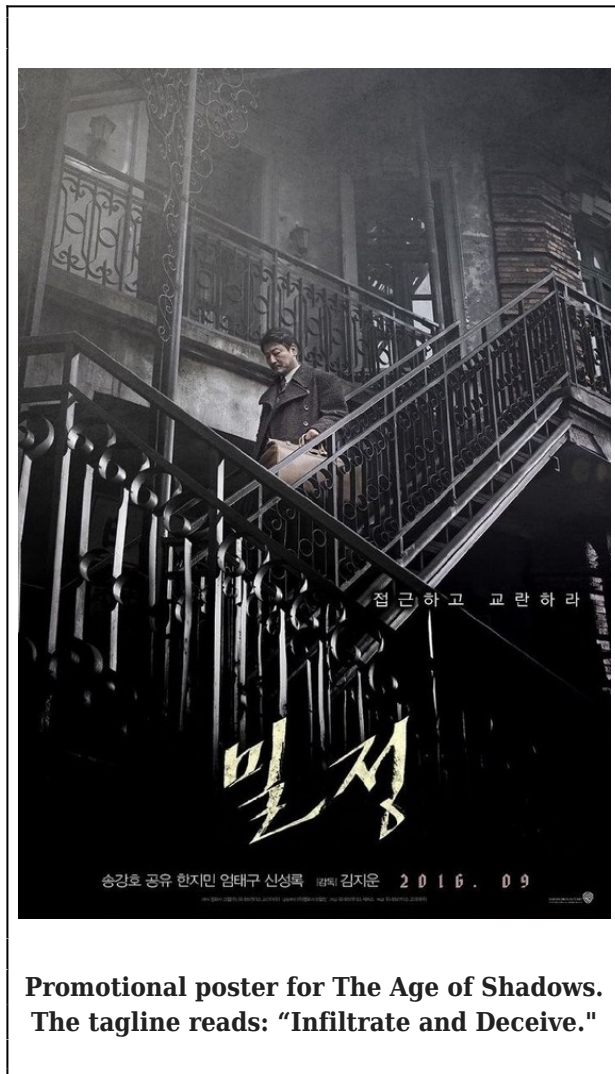
Promotional poster for The Age of Shadows. The tagline reads: "Infiltrate and Deceive."

held by leading members of the colonial government and police force, including his former superior, Higashi (Shingo Tsurumi).