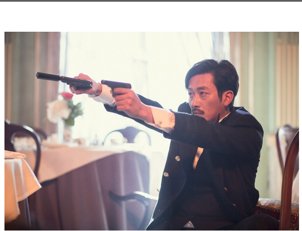
Hawaii Pistol (Ha Chōng-u), in Assassination.

out, attempt lone-gunner rescues, survive large explosions or multiple gunshot wounds, and maintain disguises despite unnervingly close calls. Borrowing heavily from Hollywood gangster and detective films, the spectacular violence renders the confrontation with colonial power through sporadic shooting sprees or bombing attacks and not a day-to-day struggle involving thousands of ordinary colonial subjects. One particularly distasteful scene set in a crowded Seoul Station in The Age of Shadows has Kim U-chin (Kong Yu) fire a pistol round point blank through the face of an oncoming Japanese soldier and into the head of a second standing directly in the line of fire.