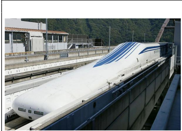
The Linear Chūō Shinkansen

fiscal spending package right after this G7 Summit suggests that the Linear Shinkansen project may be seen as the centerpiece of his fiscal policy.