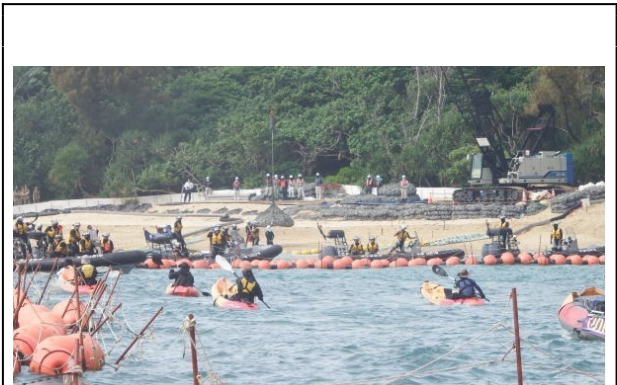
Construction begins as protestors kayaks cry out “stop!” April 25, 2017

It was a bitter day for Okinawa. The Japanese government showed, again, its blunt willingness to impose yet greater U.S. military burdens on Okinawa and its disregard for the voice of the people of Okinawa against base construction and for protection of the environment.