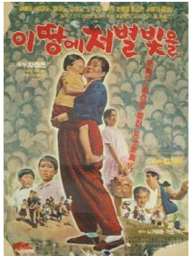
The Same Starlight on This Land, 1965

The Normalization Treaty and the mini-Hallyu of the past