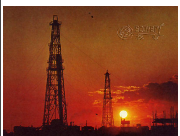
Yumen oil fields

There are echoes of that era in a banner on the street in Yumen New Town, which reads: “Make an effort to develop the economy in a fast leap!”