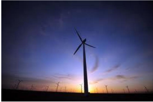
Wind turbines in Gansu

This is the other side of China's development. Although it is the world's biggest CO2 emitter and notorious for building the equivalent of a 400 megawatt (MW) coal-fired power station every three days, it is also erecting 36 wind turbines a day and building a robust new electricity grid to send this power thousands of kilometres across the country from the deserts of the west to the cities of the east.