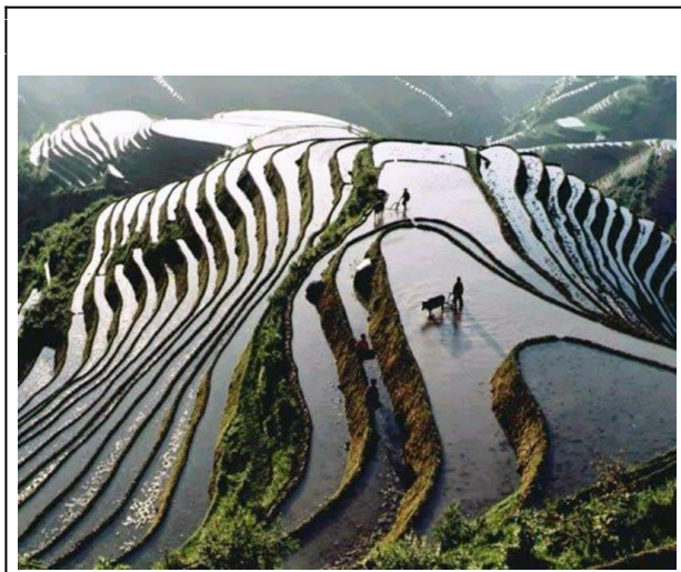
Terraced rice fields

producer of greenhouse gases in 2012, continues to set energy prices, and to ensure that energy produced from coal powered plants remains cheap. Chinese industry thus remains dependent on an energy source that not only holds a dominant position, but continues to grow and to spew vast amounts of pollutants and global warming gases into the atmosphere. It's almost as if there are two Chinas—one on the leading edge of developing energy from clean and renewable sources, and the other recklessly polluting land, air, and water in a break-neck race to industrialize as rapidly as possible, and maybe, after that task is accomplished, to clean up their environment. In response to Western environmental critics of these rapidly expanding emissions, Chinese officials have asserted that this was precisely the Western approach. But even that pattern is not so clear as the pressures for continued economic development in the world's richest economies continues to drive our unsustainable dependence on fossil fuels.