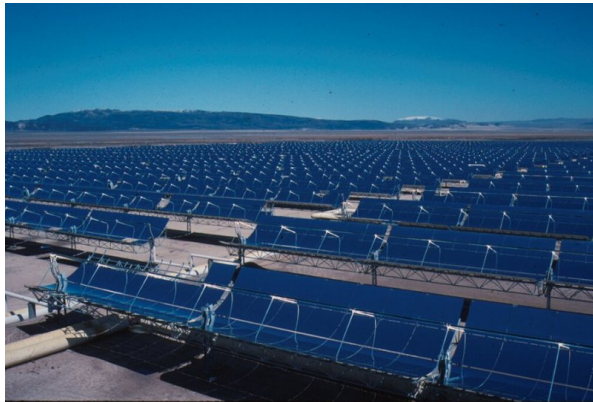
Dunhuang Solar Plant

As it aims to reduce fossil-fuel use, the country is investing heavily in wind and solar energy. Gansu province, once known for dirty mines and oil wells, is being revitalised.