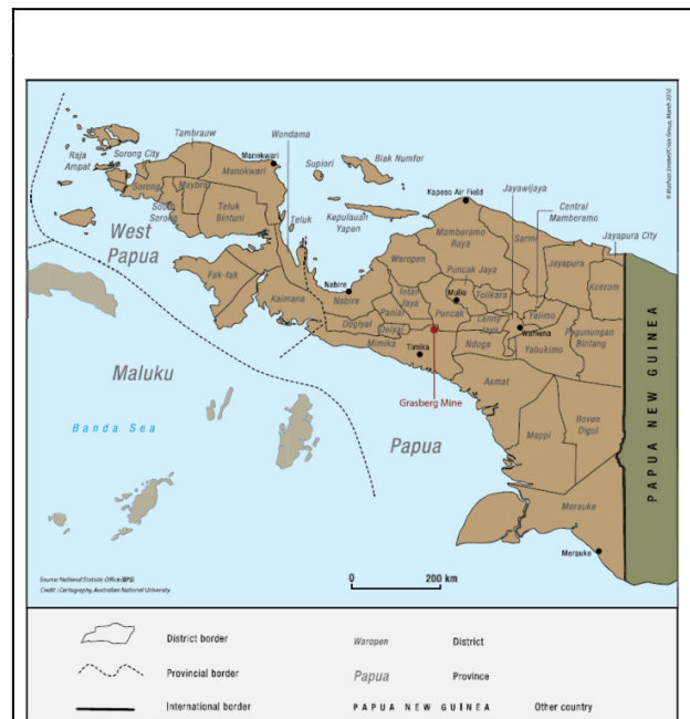
Map Two showing the territory of West Papua including the Indonesian provinces of Papua and Papua Barat (West Papua) and the administrative regions called kabupaten (regencies).

1971 up to 2000. From my calculations this meant that indigenous Papuans comprised about 48% of the entire population of West Papua (Papua and Papua Barat provinces) in 2010. The figures received from the BPS are from the 2010 census and identify the inhabitants of Papua province as either Suku Papua (Papuan tribe) or Suku Bukan Papua (non-Papuan tribe). According to these figures out of a total population of 2,883,381 in Papua Province, some 2,121,436 were Papuan (73.57%) and 658,708 Non-Papuan (22.84%), the remainder being unknown. The BPS figures for Papua Barat show that the total population is 753,399 of which 51.49% is Papuan.