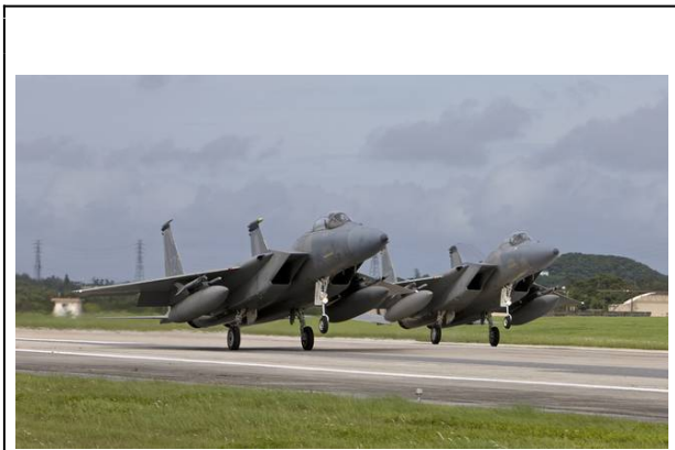
Jet fighters at Kadena Air Base, Okinawa

Misawa Air Base (Aomori Prefecture) are deployed to the Middle East. All of Japan’s air space is defended by Air SDF. In Okinawa the U.S. Air Force’s ammunition depot at Kadena and the Navy’s storage facilities at White Beach have nothing to do with defending Japan. However, if U.S. forces were to return to the United States, the American government would have to pay for them. Therefore, as has been noted in Congress any number of times, it is cheaper to keep them in Japan. According to the U.S.-Japan Defense Guidelines, “Japan is fully responsible for the defense of its people and territory . . . supplemented by U.S. forces.” Even if American forces were to leave, there would be no gap in Japan’s defenses. Should the U.S. seek to increase Japan’s financial burden now, it would violate the host nation support agreement (“sympathy budget”) concluded late last year for a five-year term, meaning that it is o.k. anytime for the U.S. to kick around Japan.