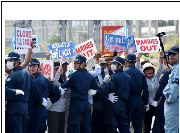
Protesters at Camp Schwab Main Gate, Okinawa