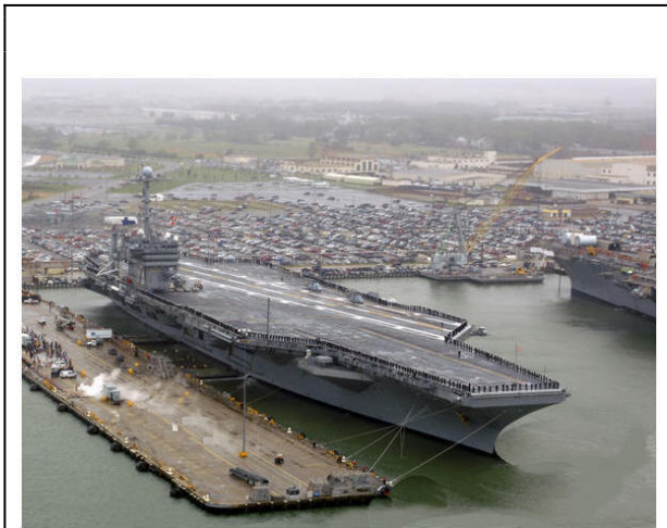
Aircraft carrier at Yokosuka Navy Base, Kanagawa Prefecture

This year Japan is paying 556.6 billion yen (4.8 billion dollars) for the stationing of U.S. forces here, 165.8 billion yen (1.5 billion dollars) for land-leases, and, according to last year’s figures, 8.8 billion yen (77 million dollars) to subsidize the bases. About all the U.S. pays for are the troops’ salaries. If our costs go any higher, we should consider treating the U.S. military as a mercenary force under the command of Japan’s Self Defense Forces.