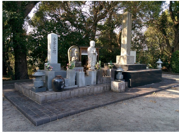
Figure 7: Monuments at Katsudachi constructed by the Omuta Society for Prisoners’ Cemetery Preservation. [April 2, 2016]

modernisation of the Japanese state and accumulation of capital.