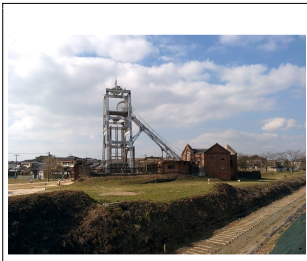
Figure 1: Entrance of the Miyanohara tunnel, the Miike Coal Mine. [March 1, 2016]

The Mitsui Miike Coal Mine, one of several UNESCO registered Meiji Industrial Revolution Sites since 2015 [Fig. 1]. While the central role of the coal industry in Japan's industrialisation was stressed through the world heritage registration process, the close relationship between pre-war industrialisation and development of the modern penal system, and the use of prison labor, has been less acknowledged. In Miike, use of convict laborers from the nearby Miike shūjikan (central correctional institution) was indispensable for the operation of the coal mine during the early Meiji period.