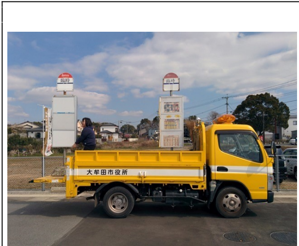
Figure 9: Omuta City removed bus timetable boards after round-trip bus service for visitors to the UNESCO-registered Meiji Industrial Revolution sites was terminated on March 1, 2016. [March 1, 2016]

inhabitants of the experiences of convict victims. As we have seen, the society has imagined Ichinoura cemetery as a symbol of the restless spirits of convicts even though there were doubtful views. Later in Katsudachi, they finally discovered physical bodies of deceased prisoners. The annual commemoration service, now held at Katsudachi and Ryugoze, is carried on by their successors even after the founders of the Society passed away [Fig. 8].