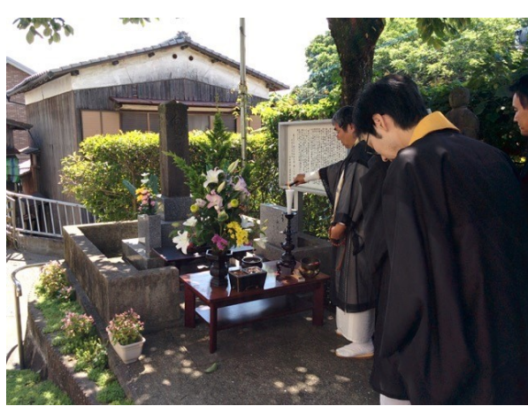
Figure 6: “Gassō no Hi,” tombstone for prisoners’ group burial, at Junshō-ji, Ryugoze, Omuta. [July 15, 2016]