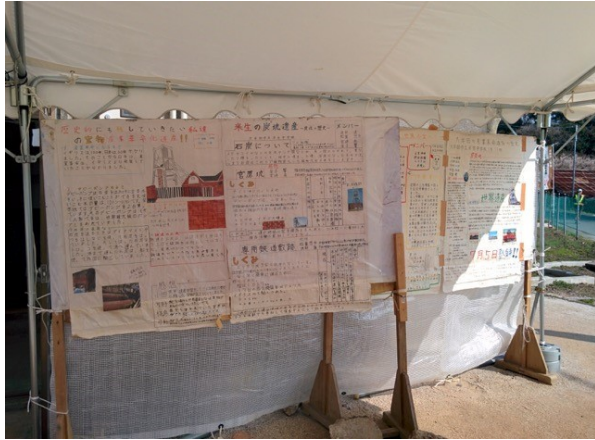
Figure 2: Posters at the remains of the Miyanohara tunnel made by junior high school students from Omuta that touch upon convict labour in the coal mine. [March 1, 2016]

The Omuta Society for Prisoners' Cemetery Preservation (Ōmuta Shūjin Bochi Hozon Kai) is a local group that has attempted to preserve the memory of prisoners' experience. Beginning in the 1960s with the goal of preserving the convict laborers' graves, for nearly half a century the Society has been collecting and preserving prisoner experiences. This paper examines the politico-discursive environment in which the society advanced its campaign. Part 1 briefly outlines the introduction of a "modern" penal system and convict labour in Japan. Part 2 delineates the history of convict labour in the Miike coal mine. Part 3 describes the activities of the Omuta Society for Prisoners' Cemetery Preservation. Part 4 examines the practice of active members of the Society. The concluding part assesses the historical and contemporary implications of the Society's activities on the social life of the coal mining town.