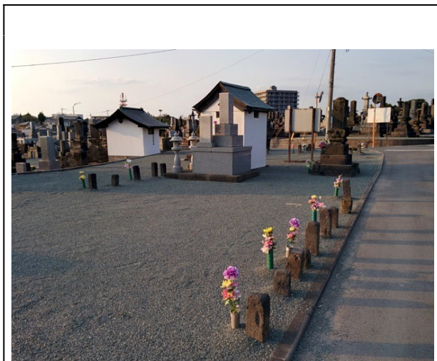
Figure 5: Tombstones at Ichinoura cemetery, Omuta. [April 2, 2016]

Interestingly, some doubted if the graves were actually those of prisoners. In the Kosaki Collection held in the Omuta City Library, there is a document containing letters from Sato Yukio, then a division chief of the Fukuoka Regional Correction Headquarters, to Motoyoshi sent between 1971 and 1972. 27 Attached to Sato's letter dated August 24, 1971 were copied materials for investigation of Ichinoura cemetery. The report concludes that the graves were not likely to be those of deceased prisoners. It speculates that they were probably neglected graves when the cemetery was moved from the previous location in Matsubara to the current site in 1912. Others also criticised the Society for propagating a false belief. 28