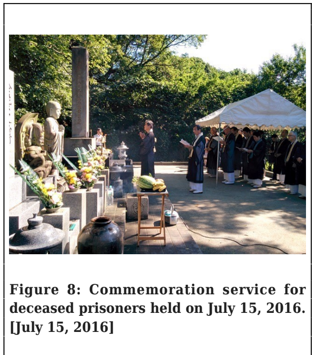
Figure 8: Commemoration service for deceased prisoners held on July 15, 2016. [July 15, 2016]

official documents of Miike prison have not yet become available. The Mitsui Coal Mine once compiled its 50-years history with a view to publication, but the manuscripts have been kept within the company following Japan's defeat in the world war. 53 It is likely that the company was and remains sensitive about the effects that the 50-years history could have in post-war Miike and beyond. If the manuscripts had been made public, they could provide valuable sources for Urakawa and Kosaki, for whom writing and editing the history of convict labour and mourning for the deceased convicts were political acts to appeal to workers' consciousness as victims. The absence of the historical official records and the fragmented nature of Urakawa and Kosaki collections itself are reflections of the post-war political history of Omuta.