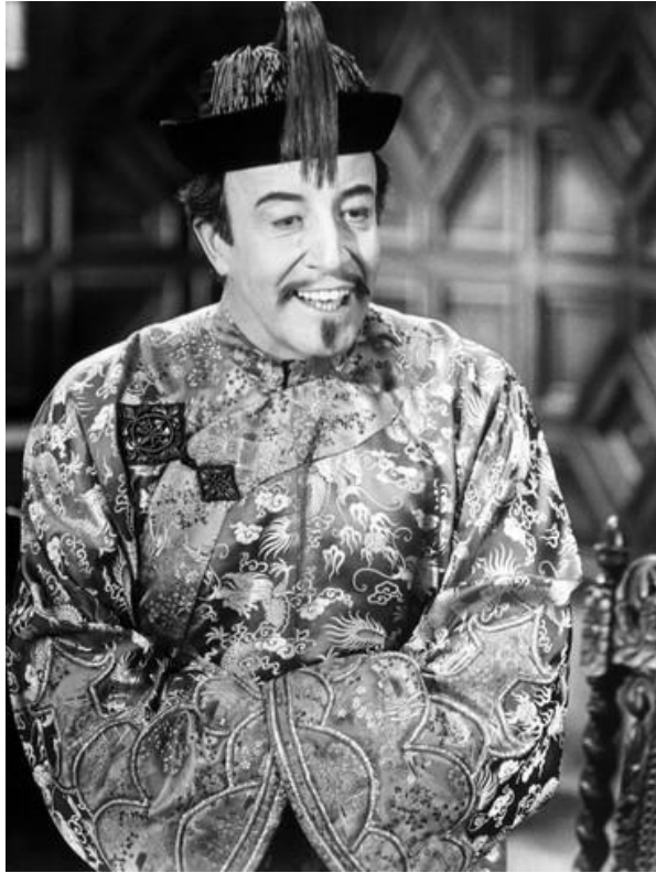
Peter Sellers in Murder by Death

In the 1976 parody of the classic detective genre cheekily entitled Murder by Death , five world-famous fictional sleuths are gathered at the gothic residence of an eccentric hermit. The comedian Peter Sellers plays a Charlie Chan look-alike in the film. Sporting a garish Chinese robe that could only have been taken straight out of a Chinatown curiosity shop and uttering insipid lines with all of the articles systematically exiled (prompting the exasperated host, played by Truman Capote, to holler “Use the article!”), he delivers a Charlie Chan mock-up that is barely distinguishable from Fu Manchu. In all likelihood, Sellers was cast in this role by dint of his previous stint playing Fu Manchu in an episode ( The Terrible Revenge of Fred Fu Manchu , 1955) of the BBC radio program The Goon Show . Still worse, four years later, he went on to star in the title role of The Fiendish Plot of Dr. Fu Manchu (1980), his last and probably worst film. Though Sellers