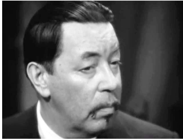
Warner Oland in Charlie Chan's Secret , 1936

for the outward projection of law's aporia. Hence "it is precisely the laws at the margins of a liberal democratic state that define its center" (Ruskola 2013, 8).