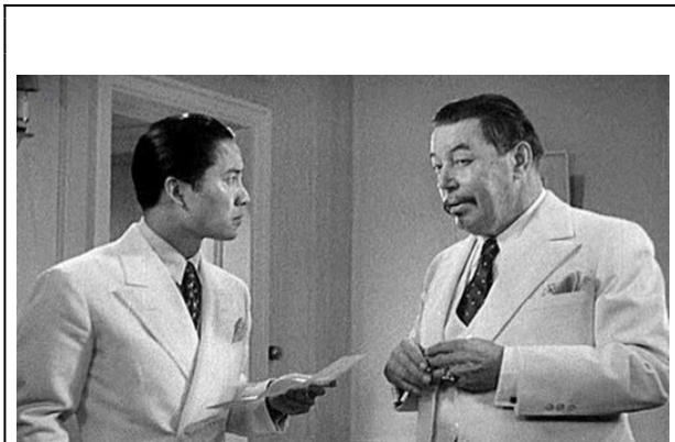
Chan & son

who pursued crimes in both the metropolitan precincts of the Occident and its far-flung empire. Charlie Chan is the bastard offspring of detective fiction and legal Orientalism: As a man of law, he faithfully executes his office within the broad framework of law and order; he adopts the scientific method of gathering evidence, following clues, and probing suspects; he interacts with his law-enforcement collaborators in a dignified, professional manner; he conducts business in an impeccable white linen suit, never losing his cool while in the line of duty. Overlaying this bland, staid persona are his Oriental quirks: his usual sidekick is his Number One Son Lee Chan, a plot contrivance apparently alluding to the Orient's inability to maintain a wall of separation between impersonal law and nepotistic loyalties; he buries the inductive method in a florid verbiage that leaves his interlocutors more mystified and awed than enlightened; he has no qualms about using deception and trickery on anyone, whatever their relationship with the law, guided only by what he calls, in deadpan manner, the "psychic" abilities of the Chinese people (Biggers 1925, 125).