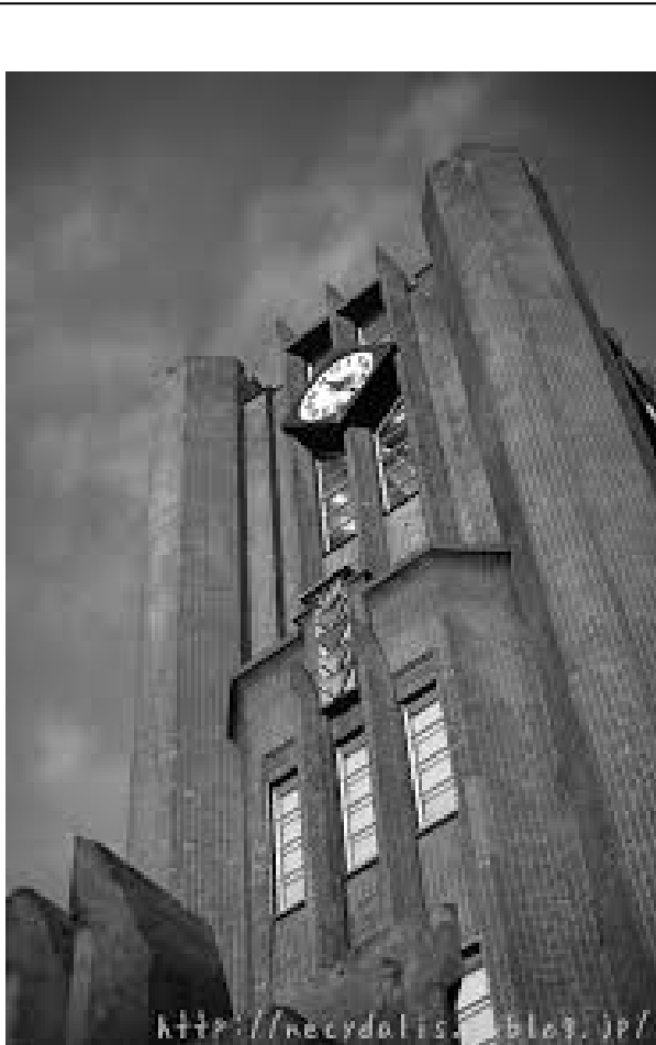
The clock tower at Tokyo University