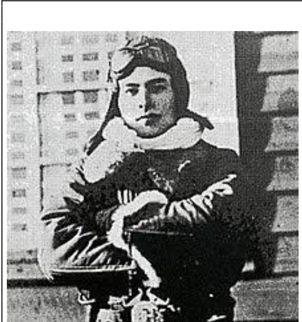
A student kamikaze pilot on eve of flight