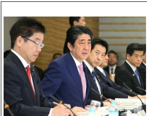
Prime Minister Abe addressing the Council for the Realization of Work Style Reform

premiums no matter how long they worked. He ultimately resigned as prime minister after barely one year. However, Abe's second term, now the third longest in Japanese history, has been far more successful, largely because of opposition party weakness but also because of much better marketing of his policies. Immediately after resuming the prime ministership, Abe announced the launch of Abenomics, an ambitious and attention-grabbing policy package to jumpstart the long-stagnant economy. The first two of the famous Three Arrows of Abenomics were monetary easing and fiscal stimulus, which at least appeared to boost growth, but benefited primarily large firms, while the third (and more painful) arrow, structural reform, did not take flight.