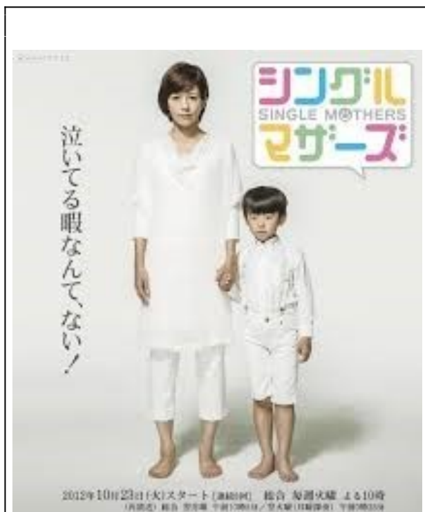
Advertisement for a television program

In practice, the Work Style Reform agenda essentially continues the strong push for employer-friendly reform made by Abe since the beginning of his prime ministership, with the usual re-marketing and a bit of reorientation. As seen in the table below, the agenda consists of nine items with the potential to greatly change employment practices in Japan; none are truly new, but the Abe Government has arguably pressed them harder than previous administrations. At least two other important reforms demanded by the LDP's backers in the employer community, kinsen-teki kaiketsu (monetary resolution, a scheme to enable companies to dismiss regular workers upon payment of severance) and expanded use of gentei seishain (limited regular employee, intended to be a an employment status midway between regular and non-regular employee), are not on the list, even though they are being intensively pursued