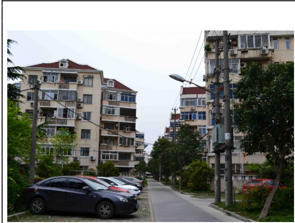
A Shanghai community.