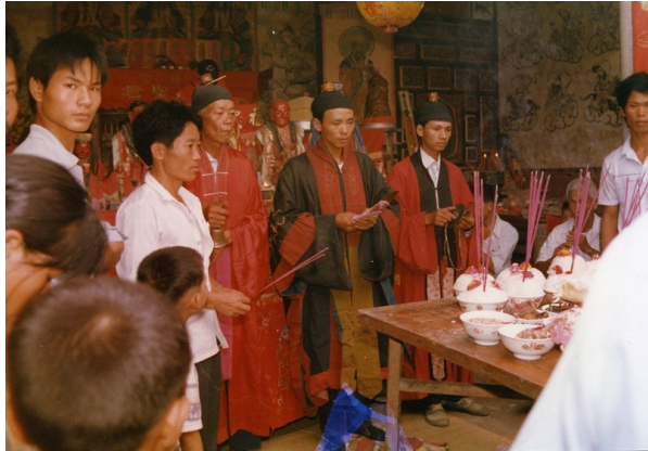
Daoists conducting offering to orphan souls in a temple in southern Fujian, 2010