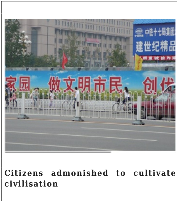
Citizens admonished to cultivate civilisation

gentry. National government would then have to be a public administration of the central state responsive to such local assemblies (Hamilton & Wang (1992), pp 144-5). Fei's reforming text is peppered with Confucian aphorisms that were addressed to junzi (the literati of pre-imperial and imperial China).