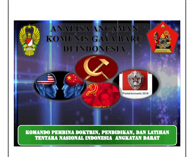
See all slides here.

programs," the document denounces "idealizing pluralism and diversity in the social system" as a specific "KGB" threat now rising in Indonesia. Using threat assessment techniques drawn from Western intelligence doctrine and texts — excerpts from which are used, sometimes in English — the document warns of the communist enemy "separating the army from people" and "using human rights and democracy issues while positioning oneself as victim to gain sympathy."