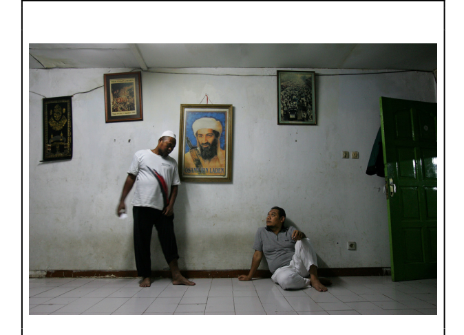
Islamic Defense Front headquarters in Jakarta, where a portrait of Osama bin Laden hangs on the wall in 2007.

The NSA had no comment on the content of the intercepts. The White House did not respond to requests for comment.