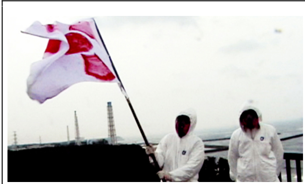
Hoisting the radiated Hinomaru flag with TEPCO Plant in the background, April, 2011

We came up with our name because we wanted something upbeat, that sounds like dotcom,” – may turn out to be the perfect formula to push the boundaries of art and protest for a newly alerted, infuriated and energized public whose recent demonstrations in Tokyo have been the largest in mainland Japan since the 1960s.