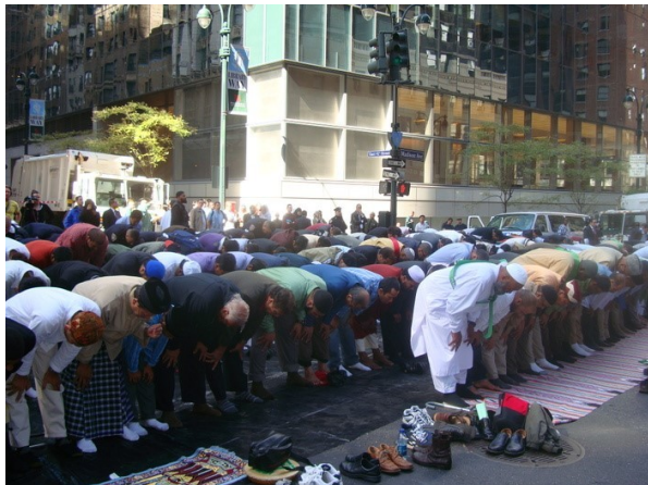
Muslims gather for prayer in New York City streets

One year after the New Jersey suit was filed, a separate action was filed in federal district court in Brooklyn on behalf of Muslim residents of New York City. Named defendants included then-Mayor Michael Bloomberg and Chief of Police Raymond Kelly. The plaintiffs included a community college student who organized a food program infiltrated by an undercover police agent and the imam at a mosque who said he was repeatedly questioned by undercover police officers. Both men, Muslim residents of Brooklyn, claimed that fear of the presence of undercover police forced them to reshape their words and actions in order to avoid potential conflict or misunderstanding by police informants and drove potential members away from their groups.