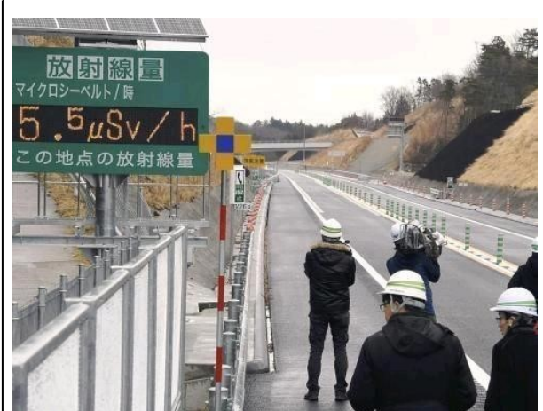
Area where some police officers and construction workers remain active on Route 6. The radiation level is 5.5 mSv. (2015). When I drove through the Tomioka-machi area near the Fukushima Daiichi this summer (2016), a bulletin board indicated 4.8 mSv.

Mutō: It is indeed propaganda. These things are actually happening in Fukushima and other affected regions.