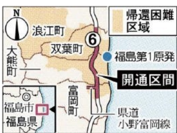
The red colored part of Route 6 was opened to the public. It is only 1.5 km away from the power plant, and cut through the areas designated in beige as uninhabitable for now.

Hirano: So if you had the data to prove the correlation between health and radiation, you would want to pursue the responsibility of these scholars once again.