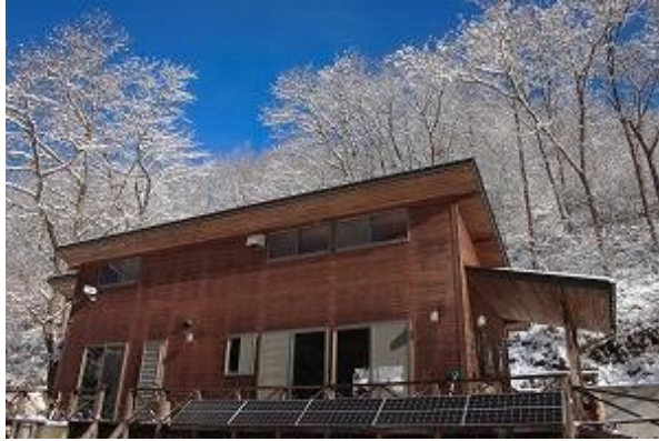
Kirara in winter