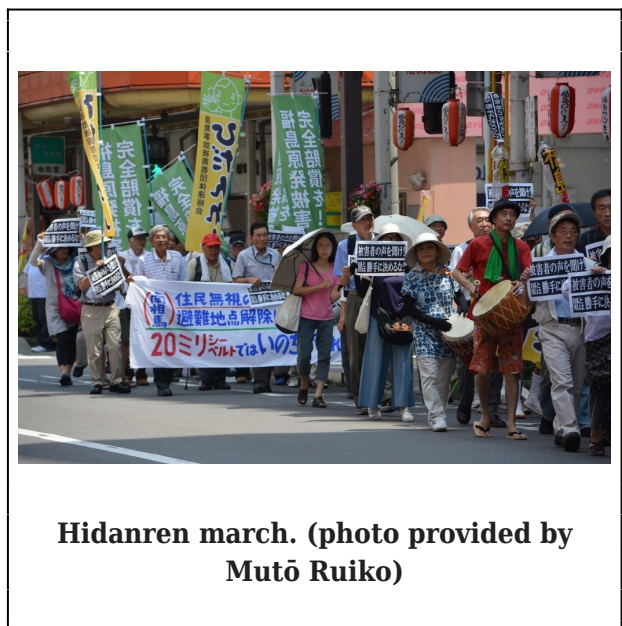
Hidanren march.