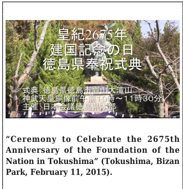
“Ceremony to Celebrate the 2675th Anniversary of the Foundation of the Nation in Tokushima” (Tokushima, Bizan Park, February 11, 2015).

continue to play an important role for advocates of a mytho-historical nationalism until today.