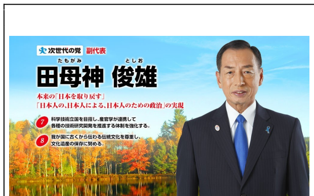
Website of Tamogami Toshio as Deputy President of the Party of the Next Generation (2015).

defense policy, and on Abe Shinzō himself. In a book titled “Tamogami’s Army of the Land of the Gods,” he claimed that Japan should have the right to collective self-defense and should arm itself with nuclear weapons, aircraft carriers, AEGIS destroyers armed with nuclear missiles, and long-range bombers (Tamogami 2010). In order to finance the vastly increased defense expenditure this would entail, he suggested cutting the child allowance (ibid.: 206). In “On Abe Shinzō,” he praised Abe for being “one of the few politicians who is not obsessed with the masochistic view of history” (Tamogami 2013: 9 and ch. 2). In contrast, he judges those politicians who favor a conciliatory approach to foreign policy as “prime ministers destroying Japan,” singling out former Prime Ministers Fukuda Takeo, Nakasone Yasuhiro, Obuchi Keizō, Miyazawa Kiichi and Hosokawa Morihiro (ibid.: 77-90).