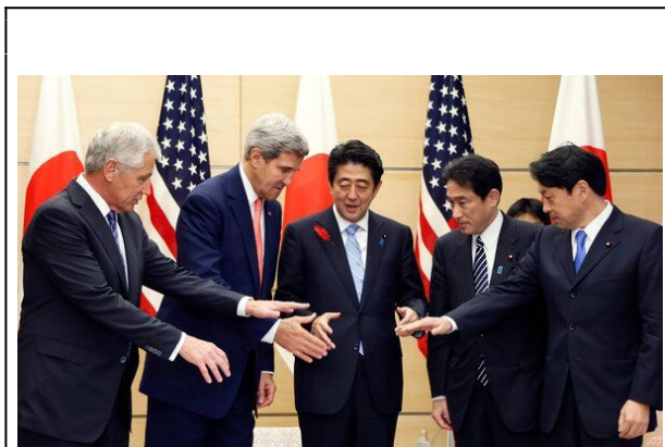
Choreographing Closer US-Japan Security Ties 2015

Hill revise its description of the comfort women in an American history textbook (Fackler 2015). This provoked a public relations disaster for Japan and publication of a letter by a group of US-based historians (including eminent scholars such as Carol Gluck and Sheldon Garon) expressing “dismay at recent attempts by the Japanese government to suppress statements in history textbooks both in Japan and elsewhere about the euphemistically named ‘comfort women’ who suffered under a brutal system of sexual exploitation in the service of the Japanese imperial army during World War II” in the newsmagazine of the American Historical Association (Dudden et al. 2015, 33). Since the U.S. government remains firmly opposed to revision of the Kono Statement, Abe and his supporters have conducted hit-and-run attacks against it in the Diet to discredit this mea culpa while denouncing the 1996 UN Coomaraswamy Report on “comfort women” (UN Commission of Human Rights 1996). Revisionists are thus waging a campaign to deny that Japan was responsible for forced recruitment of young women and that the “comfort women” system constituted sexual slavery, again tarnishing the dignity of the nation and its victims.