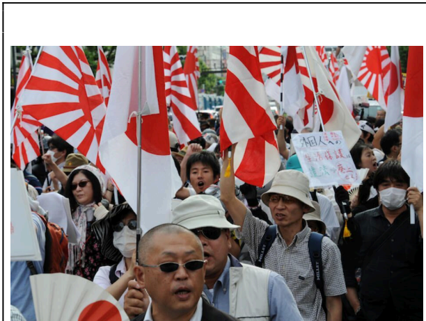
Zaitokukai Demonstrations Target ethnic Koreans in Japan

persistently exhibit hate messages targeting these two nations.