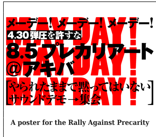
A poster for the Rally Against Precarity

precarity hit the lower strata of society and youth especially hard, leading to increased suicide, divorce, non-marriage, deflation and lower productivity because firms no longer invest in training disposable workers. In this acute social crisis, political leaders sought to divert attention to “external enemies.”