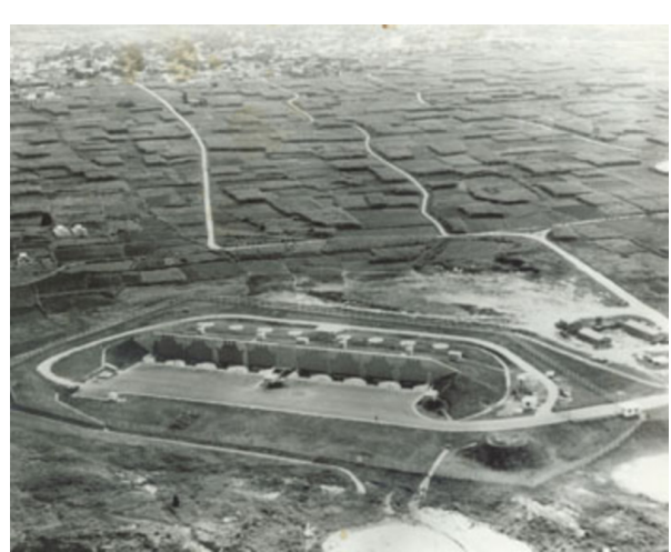
Deadly secret: A 1962 aerial photograph shows Okinawa's first Mace missile site at Bolo Point, Yomitan. Below: One of the Okinawa Mace missiles is now displayed at the National Museum of the USAF in Dayton, Ohio.