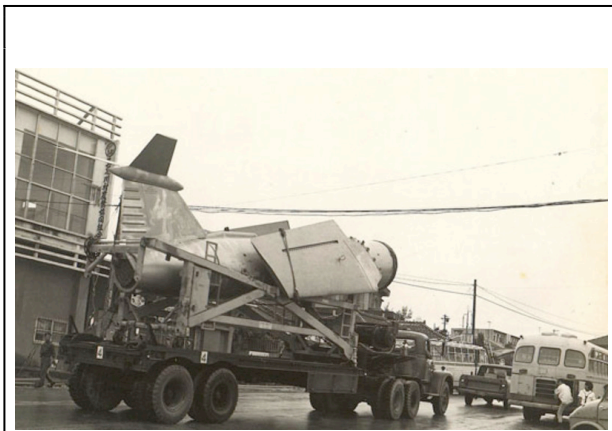
Head-turner: A Mace missile is trundled through the Okinawa city of Gushikawa in the early 1960s in a rare open display.