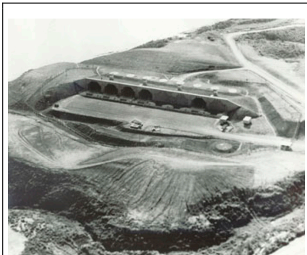
Another of the Mace bases in Kin, Okinawa, is pictured in the early 1960s.

a fratricidal ideological debate over communism's future. However at the time, the Pentagon continued to operate on the assumption that the two countries were allies. This misconception laid the basis of America's infamous blueprint for atomic war the Single Integrated Operational Plan dubbed by one government adviser as a "massive, total, comprehensive, obliterating strategic attack on everything Red." 5 While JFK had made token changes to the plan in early 1962, the amendments apparently hadn't filtered down to the missile control center on Kadena.