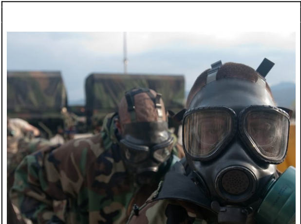
The 20th CBRNE Command (Chemical, Biological, Radiological, Nuclear, Explosives) is participating in Exercise Ulchi Freedom Guardian in South Korea, Aug. 17 - 28. 53

When the United States looks at Korea, it sees China.