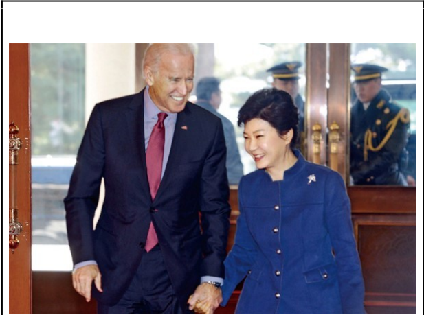
US Vice President Joe Biden clasps hands with President Park Geun-hye at the Blue House before Biden signs the visitor's book, Dec. 6. 40

So, in analysing world affairs the starting point must be the US. What does America want? That, needless to say, often bears little connection with what it proclaims as its objective. Analysis must be hard-nosed looking beyond the spin and rhetoric, focussing on actions and seeking real explanations. When we have some idea of America's position we can start looking at the other players, in descending order of importance. For most countries, most of the time, the United States is their major strategic partner-cum-adversary. They tend to tailor their policy in relation to third countries in the light of their political relationship with the United States. However for many countries, and South Korea is by no means alone, there is the dilemma of reconciling the economic importance of China with the relationship with the US. 39 At the same time we must presume that Washington has a global grand strategy (however incoherent and subject to various factions that may be) and that this strategy prioritises and subordinates the part to the whole.