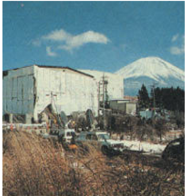
Aum Shinrikyo facility for manufacturing sarin, Satyan 7, Yamanashi Prefecture, 1995

be summed up in the following points: 1) Promote worship of the imperial household at the heart of our state and people, whose imperial lineage can be traced over 125 generations of unbroken descent (back to origins of the sun goddess). 2) Eliminate the occupiers-drafted constitution and accompanying problems that inhibit the independent will of the state to protect its security and turning national defense over to a foreign power. NK therefore seeks to amend the constitution to fully utilize the Self-Defense Forces. 3) Restore a politics that emphasizes the importance of national interests, reputation, and sovereignty, including paying homage to Japan’s war dead at Yasukuni shrine. 4) Nurture young people to cultivate patriotic spirit, respect for the national anthem, flag, and history, and cherish quintessential Japaneseness. 5) Bolster defense forces in order to effectively assume global leadership and counterbalance threats posed by China and North Korea. 6) Finally, build friendly relations with other countries through exchange programs. In short, their overarching concerns are to promote a narrow state-centric notion of prosperity and well being. Stated differently, they are unconcerned about the welfare of ordinary Japanese.