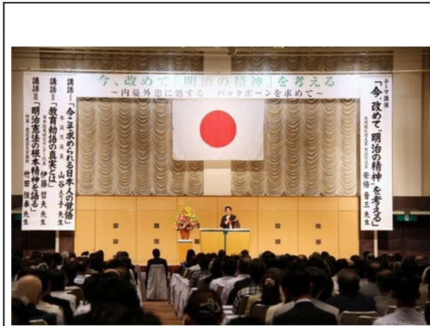
Abe Shinzo speaking at Nippon Kaigi event “on the Meiji spirit,” 16 July 2012

Nippon Kaigi merits concern and scrutiny. NK adherents profess to promote Japan’s prosperity and international prestige, to restore Japan’s national pride and unify the country. These goals seem honorable and appealing to many Japanese. Nonetheless, since NK supporters are uncritical in their affirmation of the imperial past and suppression of civil liberties, they may achieve the opposite results. Herein lies their contradictions and paradoxes.