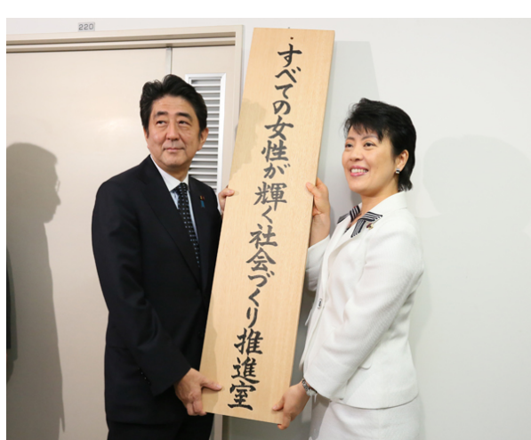
Establishment of “office for the encouragement of building a society in which all women shine,” 2014

Moreover, NK’s willful disregard of equality between women and men is in opposition to international conventions and remedial actions for gender equality (e.g., the Convention on the Elimination of All Forms of Discrimination against Women - CEDAW). NK’s obsolete traditional model of family fails to keep up with women’s diverse lifestyles, families, and work styles, and does not accommodate them with viable options. On the contrary, women are roundly penalized in various forms if they do not comply with or fit the NK/LDP model of family functioning and of women’s roles. Consider the facts that “about 1 in 3 women in Japan aged between 20 and 64 who live alone are living in poverty.” 83 54.6% of single parent/lone adult (overwhelmingly mothers) households containing one or more children is considered poor, living on less than half of median income. 84 Note, too, the gender disparity found in the womenomics initiative to promote women’s advancement and empowerment in the business world under Abenomics. In the Gender Equality Bureau Cabinet Office, there is not a single woman in the photo of “a group of male leaders who will create a society in which women shine.” 85 It will