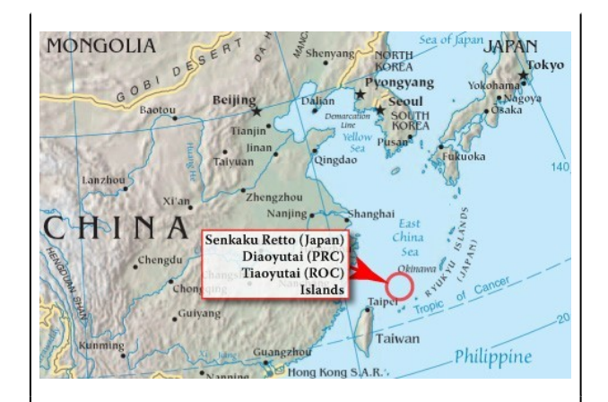
Japan, the People's Republic of China and the Republic of China all claim the Senkaku/Diaoyutai/Tiaoyutai Islands

The war-renouncing provision of the Constitution ensured compliance with the jus ad bellum regime, and indeed Japan has not engaged in a use of force since World War II (jus ad bellum is the regime of international law that governs the use of force - it essentially prohibits all use of force against other states, with two exceptions, namely the exercise of the right of individual or collective self-defense, and collective security operations authorized by the U.N. Security Council). But with the purported "reinterpretation" and revised laws which the Prime Minister has said would permit Japan to engage in minesweeping in the Straits of Hormuz or use force to defend disputed islands from foreign "infringements" -Japan has an unstable and ambiguous new domestic law regime that could potentially authorize action that would violate international law.