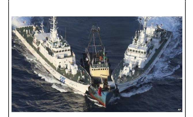
Activists from Japan, China and Taiwan have attempted to sail to the Senkaku/Diaoyutai Islands

This process, which circumvented the formal constitutional amendment procedure, as well as the substance of the "reinterpretation" and subsequent legislation, has been condemned within Japan as being unconstitutional – by constitutional scholars, former Directors of the Cabinet Legislation Bureau, a former Supreme Court Judge, and tens of thousands of protesters in the street (for more on this, see this essay in JURIST). But leaving those issues aside, several of the changes also raise international law issues, which have been subject to far less scrutiny within Japan, and have gone virtually unnoticed outside of Japan.