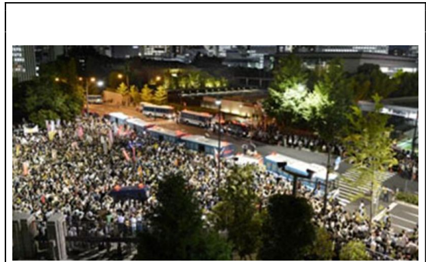
The crowd at the PM's residence, June 29.

block housing the Cabinet building. Some construction work was taking place next door and a large sign adjacent to the PM's official residence read 'Safety First' ( anzen daiichi ). I couldn't help but smile at the irony. Organizers were directing people arriving from other directions to join the back rather than go to the front where it was getting congested.