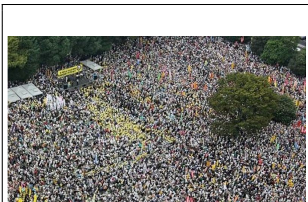
Tokyo Demo on the anniversary of 3.11 disaster