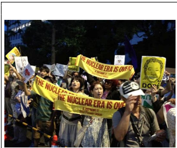
The Nuclear Era is Over if you want it

The main chant that I heard was ‘No Restarts!’ ( saikado hantai ) which people were shouting together in response to cheerleaders with megaphones and groups of drummers spaced out down the line. By around 7.30 it was deafening. Earlier, other slogans were shouted, usually to a drum beat, such as ‘Give Back Fukushima!’ ( fukushima kaese ), ‘Noda Quit!’ ( noda yamero ), and one I heard in English, ‘Shame on TEPCO!’. There was also no shortage of flags, signs and banners of varying sizes and qualities, in Japanese, English, and both, all with messages against nuclear power, the restarts and the Noda administration. Many of these were home made and original, expressing the sentiments of those who created and carried them. Some also drove past in trucks decked out with banners. The atmosphere was that of a very well-behaved, yet very angry, carnival. It dispersed quickly and calmly at 8 p.m. as planned when the organizers called a halt.