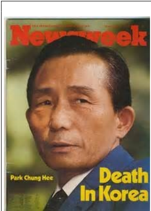
In 1961 Park Chung-hee seized power in a military coup and ruled until his assassination by the KCIA chief in 1979

progressives, economic development and more robust security capacity in order to achieve reunification of the 'nation' on Seoul's terms. (Jang 2010, 95)