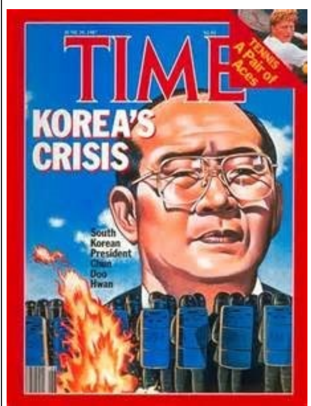
Chun Doo-hwan, another military strongman, enjoyed US support