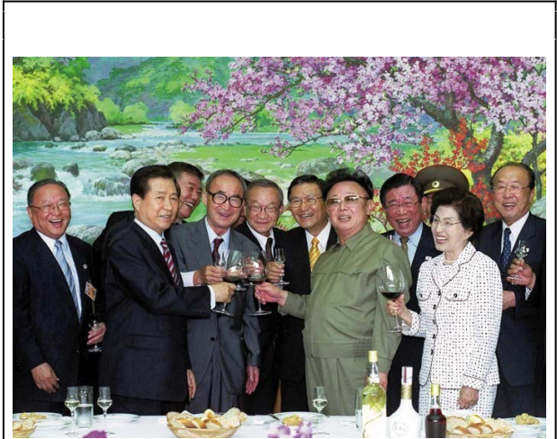
Sunshine Policy: President Kim Dae Jung meets Kim Jong-il

After industrialization and democratization in the South, in conjunction with the collapse of the Soviet Union, end of the Cold War, and periods of famine and economic decline in the North, a massive political and economic gap has emerged between the peninsula's two competing polities. 3 Furthermore, with the end of the military regime in the South came a shift in inter-Korean rapprochement policies, which have oscillated back and forth along the progressive-conservative spectrum. Even so, the framing of the unification question continues to be shaped by the belief (real or perceived) in ethnic-national unity between the North and South.