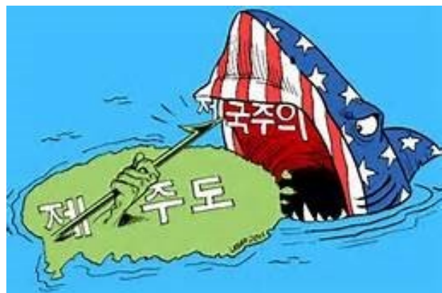
The Cheju massacre in 1948-49 by rightwing Koreans who collaborated with Japan also implicates the US

The origins of the left-right fissure in the peninsula was principally the consequence of the colonial period in which the rightists (made up principally of a wealthy and relatively well-educated elite) were the clear minority, having in some form or other collaborated with the colonial power in order to secure their privileged status and the access it facilitated. That the rightists were the minority and suffered from legitimacy concerns-both in terms of coercive capacity and popular support-is clear.