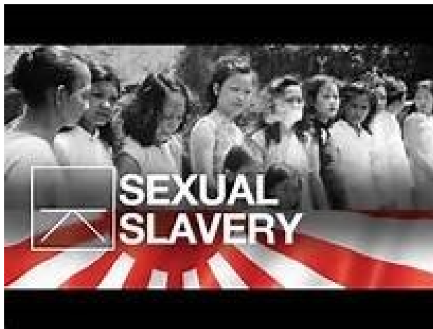
Foreign Ministers Reach Comfort Women Accord in December 2015