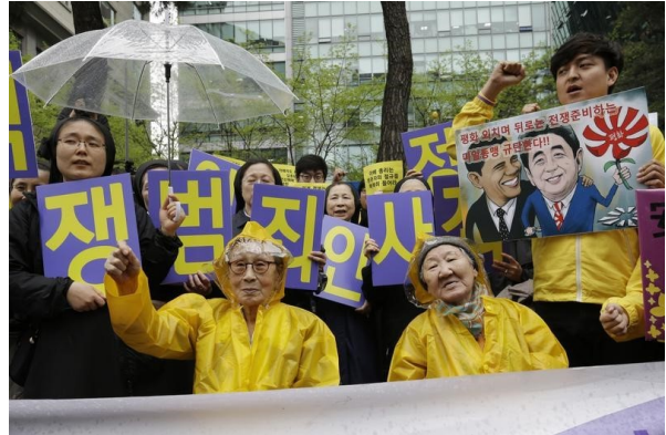
The comfort women accord has drawn widespread criticism in South Korea