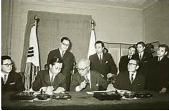
1965 Agreement normalized relations between ROK and Japan

In addition to pushing through widely unpopular normalization of relations with Japan, provoking accusations of neocolonialism, the U.S. maintained its position as South Korea's staunchest ally. Maintaining such relations and securing the support of the U.S., however, was not without its costs, as Seoul committed more than 300,000 troops to fight with America in the Vietnam conflict (Cumings 1997, 321). In return, the U.S. continued to help finance Korea, Inc.