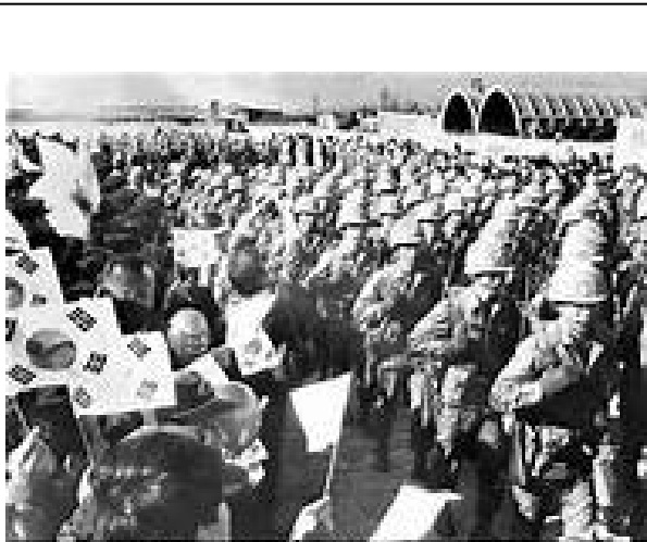
Citizens wave national flags to welcome Korean soldiers returning from Vietnam in this air photo. In 1971 when they finally withdrew from Vietnam, as many as 300,000 Koreans had served there.

In addition to pushing through widely unpopular normalization of relations with Japan, provoking accusations of neocolonialism, the U.S. maintained its position as South Korea's staunchest ally. Maintaining such relations and securing the support of the U.S., however, was not without its costs, as Seoul committed more than 300,000 troops to fight with America in the Vietnam conflict (Cumings 1997, 321). In return, the U.S. continued to help finance Korea, Inc.