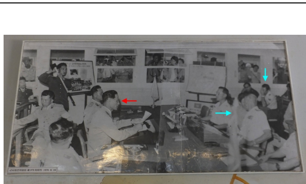
1976: 379 th meeting of the Armistice Commission (negotiating the Axe Murder Incident)

Ironically, the North Korean perspective on their dealings with the West is quite similar, the other way round of course. If you don't wish to read North Korean history books or literature, just have a look at photos of negotiations that can be found in various museums around North Korea. The American negotiators are often pictured as either holding their head in desperation or turning to their staff for help, while the North Korean counterpart is calm, determined, and self-confident.