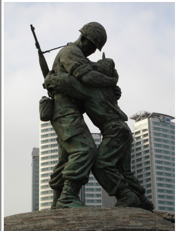
Monument in front of the Korean War museum in Seoul: Two brothers meet on the battlefield. Note the obviously hierarchic relationship between the armed South Korean (left) and the unarmed and much smaller North Korean (right). 2

On February 10, 2016, the South Korean government announced that it would close the Kaesŏng Industrial Zone (KIZ) in response to the North Korean nuclear test of January 6 th and the launch of a satellite on February 7 th . The zone, sometimes simply called by the name of the adjacent city of Kaesŏng, had been the last tangible outcome of the historic first inter-Korean summit of June 2000, which later that year had earned one of its two participants, the South Korean president Kim Dae-jung, the Nobel Peace Prize. His counterpart Kim Jong-il, who hosted the summit, received none. He was compensated generously by what has been rumored to be millions of dollars from South Korea. The payment was allegedly facilitated by Hyundai. 1 That is the same company that managed the Mt. Kŭmgang tourism project in North Korea, another successful joint project that has been frozen since 2008. Through its subsidiary Asan, Hyundai also built the Kaesŏng industrial zone.