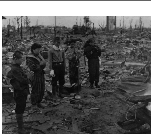
A cremation in the ruins in Nishi-Sugamo, mid-April 1945