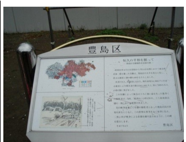
Memorial plaque for the victims of the April 13-14 air raid in Minami-Ikebukuro Park. The map at the top left shows the burned area of Toshima ward in red.

Nezuyama was the local name for a thickly wooded area to the east of Ikebukuro Station. During the war, four large public air raid shelters were built there. On the night of the air raid, hundreds of people fled from the fires to the shelters. The heat of the conflagration around Nezuyama was so intense that whirlwinds raged through the woods. The following morning, the bodies of 531 people who perished in the fires in the surrounding districts were temporarily buried in a field at the southwest corner of the woods. All that remains of Nezuyama is that space, now Minami-Ikebukuro Park, where they hold the memorial service every year.