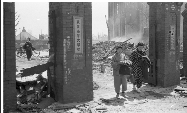
The ruins of Futaba Girls' High School on the morning of April 14, 1945

10:44p.m., after the first wave of B-29s had already passed over the Boso Peninsula. According to the Tactical Mission Report, the first bombs were released at 10:57p.m. by the 314th Wing. 19 The full air-raid warning sounded at 11:00p.m. Most witnesses state that fires broke out and spread fast at around the time of, or even before, the air-raid warning. Uchida Hyakken, who lived in Kojimachi ward about 700 meters east of the Imperial Palace, recorded in his diary that he saw fires in the east immediately after the air-raid warning sounded. Shortly after that, he heard incendiaries falling in Yotsuya to the west. The nearby Futaba Girls' High School, a prestigious Catholic school founded in 1909, was soon in flames. Beyond the school, Sophia University was also hit and suffered considerable damage. According to the university records, 74 incendiary and two explosive bombs fell on the campus that night. 20 It was located more than five miles south of the southernmost aiming point in the target area, UIC 3600.