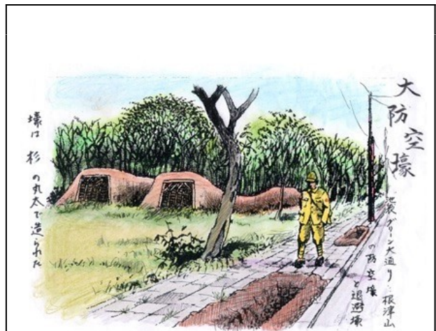
The public air-raid shelters in Nezuyama, Ikebukuro

eastern half, which difference reduces the vulnerability of the area as a whole to conflagration." 53 The vast majority of residents escaped quickly to open spaces such as woods, parks, shrines, cemeteries, firebreak zones, and areas burned in the March 10 air raid. In Ikebukuro, Sugamo and Zoshigaya in Toshima ward, most people took refuge in the public air raids shelters and surrounding woods of Nezuyama and in the spacious Zoshigaya Cemetery. The novelist Yoshimura Akira, who lived in Nishi-Nippori, fled with his neighbors to the higher ground of Yanaka Cemetery. He later recalled, "There can't ever have been so many people in that cemetery. The sky was red and it was so bright that you could clearly see the inscriptions on the gravestones. The cherry trees were in full bloom. Above them I saw the fuselages of the B-29s reflected in the red flames below." 54 Large open spaces such as these were not available to most residents of the Shitamachi district, particularly in Fukagawa and Honjo wards.