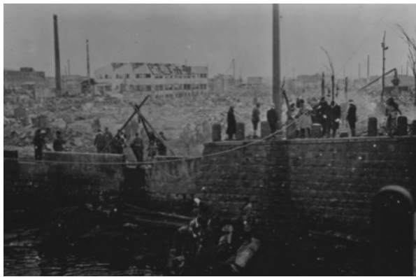
Bodies being removed from the canal below Kikukawa Bridge, March 17, 1945

get to them, dying of asphyxiation as the fires sucked the oxygen out of the air. Others died of shock from the coldness of the water, froze to death, or drowned. 51 The grid-like network of waterways also hindered escape because the bridges soon filled with people, making it impossible to cross quickly. Several thousand people died in the conflagration on top of Kototoi Bridge over the Sumida River, and as many as two thousand perished on Kikukawa Bridge and in the Oyokogawa canal below. 52 A week after the air raid, bodies were still being pulled out of the canal.