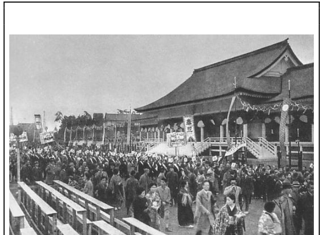
Celebration of 2600th jubilee of imperial dynasty, 11 November 1940

one hand and the German delegation on the other.