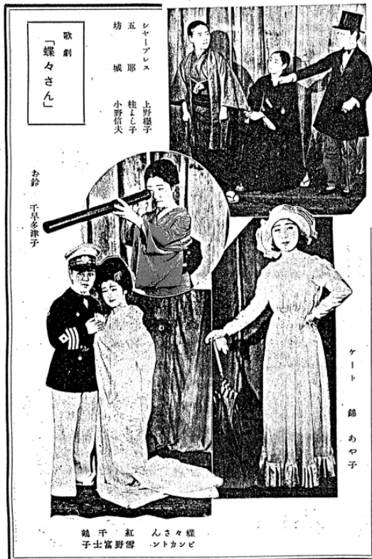
Photographs from the Takarazuka revue August 1931 performance of Concise Madame Butterfly . Pamphlet produced by Takarazuka revue. No photographer credits listed.