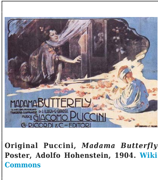
Original Puccini, Madama Butterfly Poster, Adolfo Hohenstein, 1904.