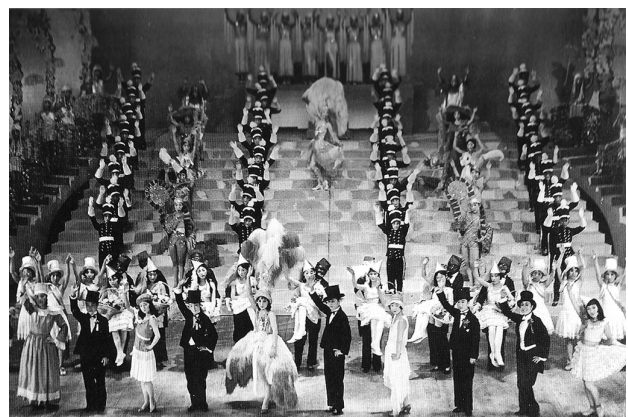
Photograph of a July 31, 1930 Takarazuka performance of Parisette .

Of course, I do, though not as well as you do (laughs). All right, then, I'll be back soon (leaves).