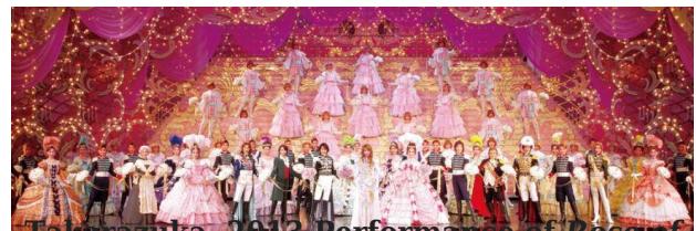
Takarazuka, 2013 Performance of Rose of Versailles: Oscar and Andre (Based on the manga Berusaiyu no bara).