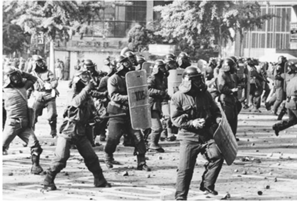
Police at Kwangju