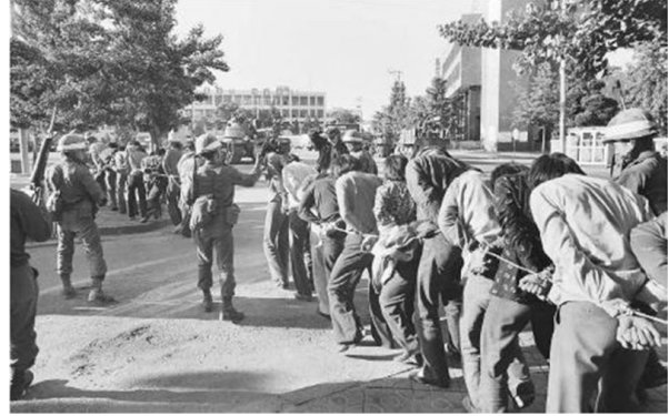
South Korean police arrest protestors during the Kwangju incident in 1980

Sweeping under the rug the tyrannical aspects of Park’s rule, modernization theorists in Washington considered U.S. policy in South Korea to be a phenomenal success because of the scale of economic growth, which was contingent in part on manufacturing vital equipment for the American army in Vietnam. The United States was especially grateful to Park for sending 312,000 ROK soldiers to Vietnam, where they committed dozens of My Lai-style massacres and, according to a RAND Corporation study, burned, destroyed, and killed anyone who stood in their path. 85 The participation of police in domestic surveillance and acts of state terrorism was justified as creating a climate of stability, allowing for economic “take-off.” Together with Japan, South Korea helped crystallize the view that a nation’s police force was the critical factor needed to provide for its internal defense. 86