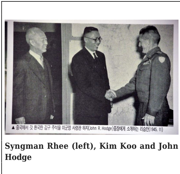
Syngman Rhee (left), Kim Koo and John Hodge