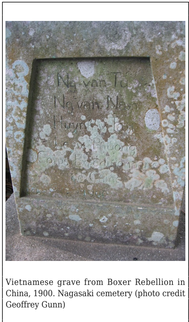
Vietnamese grave from Boxer Rebellion in China, 1900. Nagasaki cemetery

Rebellion in China, including Vietnamese sailors in service with the French navy (five warships). Not all returned home alive. The graves of 20 Vietnamese sailors killed in the Boxer Rebellion alongside French officers remain in one of Nagasaki's international cemeteries.