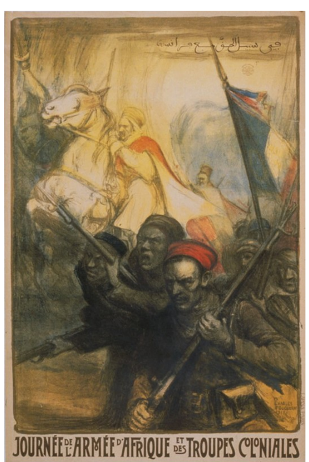
French colonial troops

Faced with early setbacks in World War I battles on the Western Front, alongside a massive attrition of manpower, France began to look to its empire and even China as sources of labor alongside soldiers. Eventually Indochina would supply some 30 percent of France's colonial forces alongside even larger contingents of Senegalese, Madagascans, and Moroccans and Chinese, in all totaling about half a million.