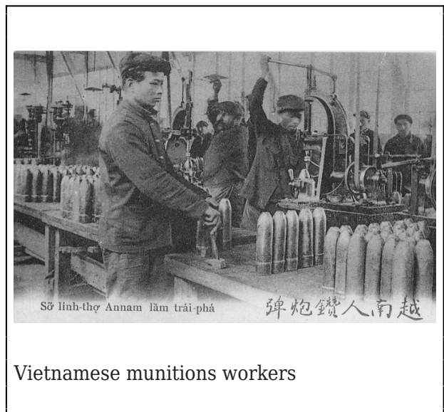
Vietnamese munitions workers

As revealed by the Journal des Marches , the workers entered separate camps pending assignment to a variety of government departments such as forestry, agriculture, public works and, especially, munitions factories.