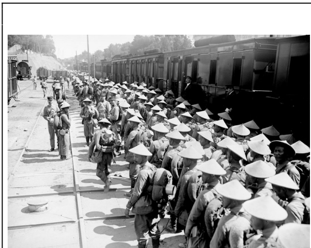
Vietnamese soldiers enter St. Raphael

Depending upon place of recruitment, as revealed in Journal de Marche documents, the soldier-worker battalions departed from Haiphong, Danang, and Saigon, variously north, central and southern Vietnam.