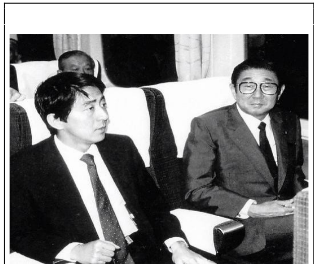
A young Abe Shinzō with his father, Shintarō

greater inspiration. Abe Shintarō was Japan's foreign minister from 1982 to 1986 and was therefore in office during the positive period in Soviet-Japanese relations that followed Mikhail Gorbachev's accession to general secretary in March 1985. Encouraged by the optimistic atmosphere that accompanied the ending of the Cold War, Abe's father succeeded in opening negotiations with the Soviet Union. He also developed an affection for the country and set the target of signing a peace treaty during the lifetime of the current generation. Abe Shinzō has openly expressed his determination to complete this unfulfilled goal of his father (Abe 2006: 34-7). Most nostalgically, when in Moscow in April 2013, the Japanese prime minister visited the sakura garden that had been inaugurated by his father in 1986. On that occasion, Abe stated: "In accordance with the will of my father, I wish to achieve such development in relations with Russia that the cherry trees enter a period of full bloom" (quoted in Gusman 2013).