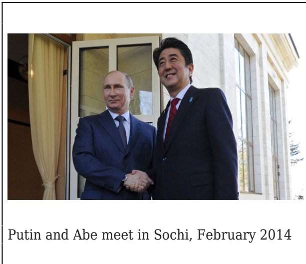
Putin and Abe meet in Sochi, February 2014