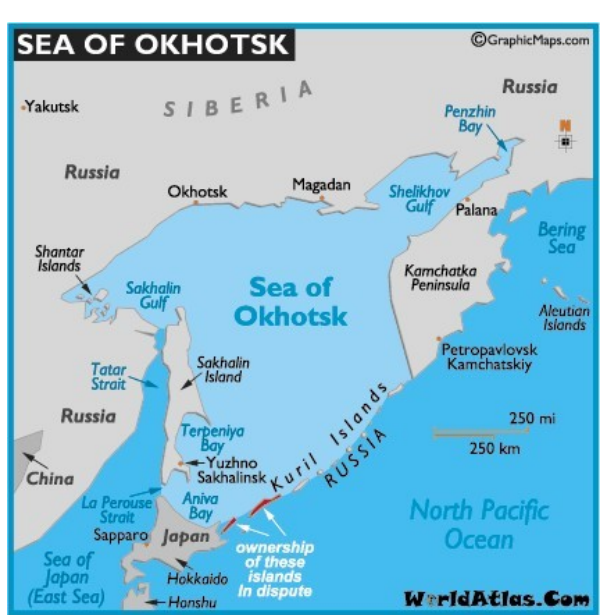
The Sea of Okhotsk, Russia's "last line of defense"

In addition to functioning as a side-door to the Sea of Okhotsk, the disputed islands are considered strategically important to Russia because of their location at the extreme end of the Northern Sea Route. The Russian government is eager to promote the commercial use of this alternative trade route between Europe and Asia. At the same time, however, the authorities are worried about the security implications of the Arctic waterways in proximity to Russia's northern coastline becoming increasingly accessible as a result of climate change. It is to a considerable extent in response to these security concerns that Russia has recently sought to accelerate its programme of developing a total of 392 military installations on Etorofu and Kunashiri. As announced in January by Defence Minister Shoigu, all of this military infrastructure is now expected to be complete by the end of 2016 ( Sankei Shinbun 2016).