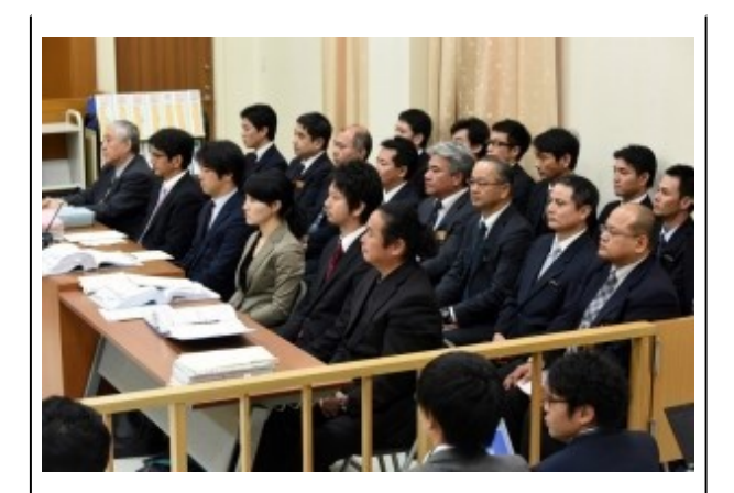
Okinawan Governor's legal team, Henoko Proxy Execution Hearing, Fukuoka High Court (Naha Branch), January 8, 2016

The Department of Defense postponement of site works, the High Court advice, the resumption of national-prefectural talks, all followed and were influenced by the Ginowan election. Okinawans could be forgiven for feeling that they were facing a concerted push by the Japanese state and its instruments to finally dispose of their protests.