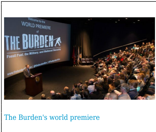
The Burden's world premiere

On January 28, 2016, US Army base Fort Hood, in Texas, broke ground on the Army's largest-ever hybrid solar and wind-power project. The USD 100 million project's 63,000 solar panels and 20 massive wind turbines will supply half the base's electricity needs "at a lower price than the power generated by fossil fuels," saving USD 168 million. 2 A week before, the US Navy, well along in its goal of 50% renewable energy by 2020, first used biofuels in its Great Green Fleet. 3 These milestones came in the same month that the Pentagon, on January 14, released a new directive on "Climate Change Adaptation and Resilience." 4