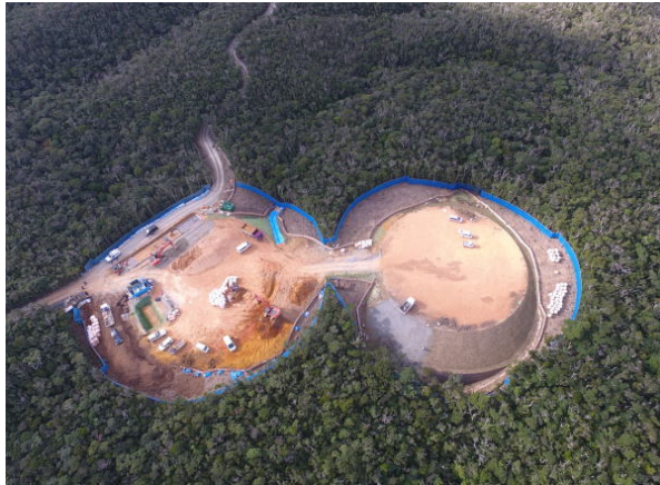
Landing zones under construction November 2016.

Meanwhile, since 1957, when 7,800 ha (19,274 acres) of the Yanbaru forest was taken over by the U.S. military and converted into the U.S. military's Northern Training Area, the U.S. military has been conducting jungle warfare training and low flying training of aircraft there. There are 22 (plus 2 newly constructed) landing zones for military aircraft and other training facilities in the NTA. Loud noise emitted from aircraft, land contamination from disposed materials and crashed aircraft, combined with logging and construction of logging roads by local forest industry, have presented and continue to present significant environmental challenges to the Yanbaru forest. The current construction of landing zones now adds to those challenges.