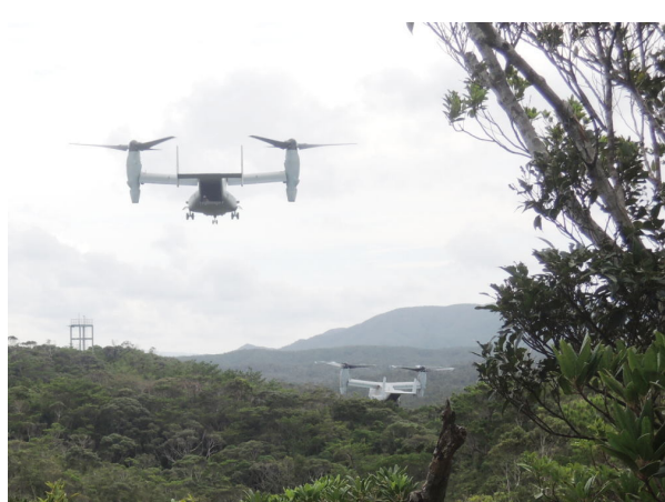
MV-22 Osprey terrain flight training in the Yanbaru forest.

We understand that, under the current U.S. National Historical Preservation Act (NHPA)(Section 402), the law that addresses matters related to the World Heritage Convention, while the U.S. military is required to take into account the effects of its undertakings, whether training or construction of facilities, on World Heritage sites and properties in foreign countries, it is not required to do so in relation to World Heritage inscription processes including one for the Yanbaru forest. We believe, however, that the spirit and intention of the NHPA is for the U.S. military to take into account the effects of allowing construction of landing zones and training on the Yanbaru forest, given that the Yanbaru forest is a World Natural Heritage candidate site and is now undergoing inscription process