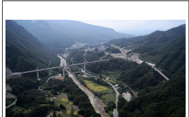
Site of Yanba Dam, 2011

River system north of Tokyo (first planned in 1952), and in general strove, however ineffectually, to shift the priority from concrete to people.