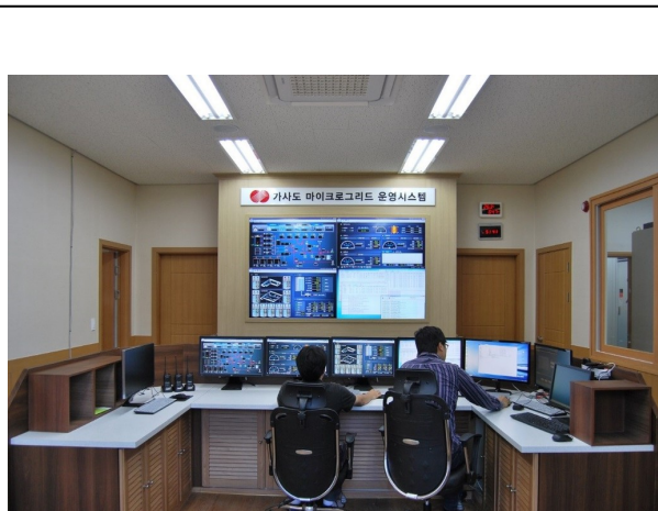
Gasa Island Microgrid Control Centre