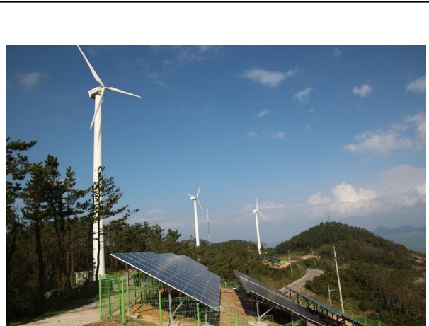
Wind turbines and solar panels used in Microgrid on Gasa Island

provide microgrid solutions was based on the company's experiences in the Jeju Island Smart Grid testbed. 51