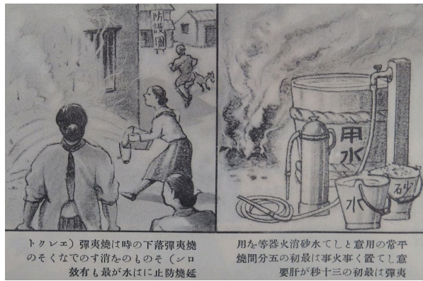
Figure 2. A prewar Japanese pamphlet on “household air defense” similarly instructs women in how to extinguish firebombs with buckets of water, sand, and hand pumps.