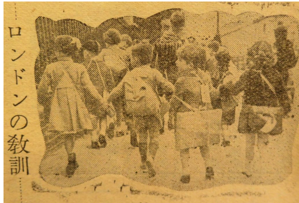
Figure 5. “The Lessons of London.” In this 1944 article in the Japanese government’s civil defense magazine, a diplomat previously stationed in the Japanese embassy in London describes what his countrymen might learn from the evacuation of children from British cities at the start of World War II.

Source: Tobe Toshio, “Rondon no kyōkun,” Kokumin bōkū 6, no. 7 (July 1944): 37.