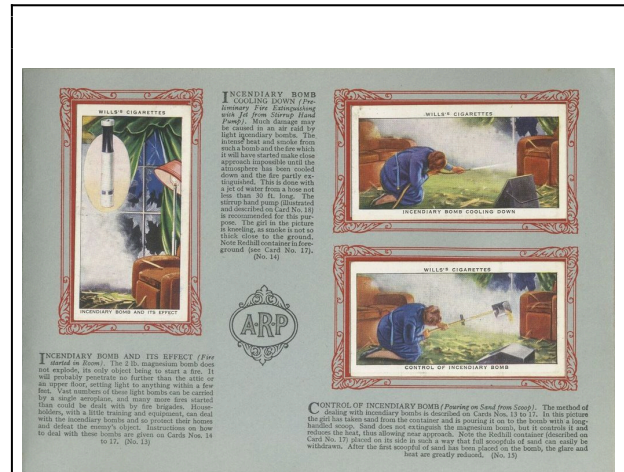
Figure 3. Commissioned by Britain’s Home Office, these prewar cigarette cards—found in cigarette packs—illustrate methods by which women could neutralize incendiary bombs that crash through the roofs of their homes. The use of stirrup pumps and sand closely resemble German techniques in Figure 1.

Source: Source: W.D. & H.O. Wills, Air Raid Precautions: An Album to Contain a Series of Cigarette Cards of National Importance ([Great Britain]: W.D. & H.O. Wills, 1938), nos. 13-15.