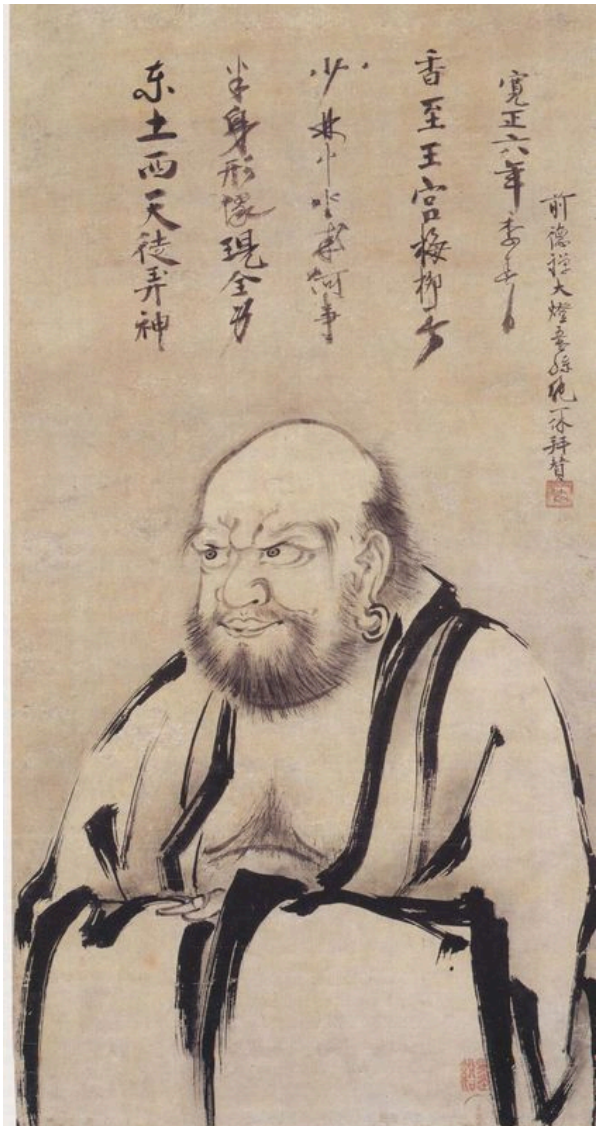
Daruma (S: Bodhidharma), Bokkei Saiyo (fl. 1452-73), hanging scroll, ink on paper

110.0 x 58.3 (43¼ x 23), Muromachi period, no later than 1465, Shinju-an,