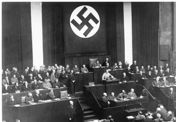
Weimar Constitution booklet Hitler before Reichstag, 1933

A lesson we might learn from the election of both the Hitler and Abe governments is that even minority-elected parties can, once they are in power, implement a political program largely opposed by the population. Hitler's Nazi