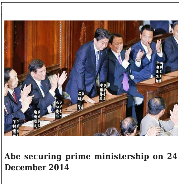
Abe securing prime ministership on 24 December 2014

In contrast to the Japanese electoral system in which the single-seat constituency system works overwhelmingly in favour of the ruling party, the German electoral system during the Weimar Era was one that eminently reflected