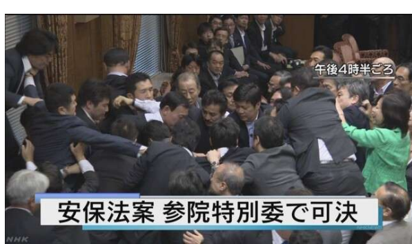
National Security Law bill forcibly passed in Upper House, 17 September 2015

Here is another historical fact that would address the question of why the Nazi Party won the March election in the first place. Even before the enactment of the Enabling Act , Hitler had begun political manoeuvring for constitutional destruction. The Abe government’s forceful enactment of the National Security Laws in September 2015, as many commentators have observed, was an important step towards dismantling the Japanese constitution that was comparable to Hitler’s passing of the Enabling Act . However, for Hitler, the Enabling Act was not the only way to destroy the Weimar Constitution. Nor will it be for the Abe government to destroy the constitution only with the National Security Laws.