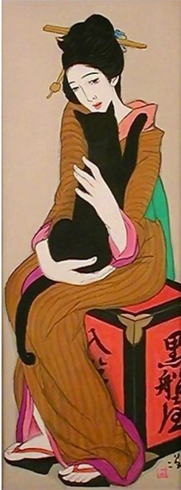
Takehisa Yumeji, Kurofuneya (Black Ship Inn), 1919. Takehisa Yumeji Ikaho