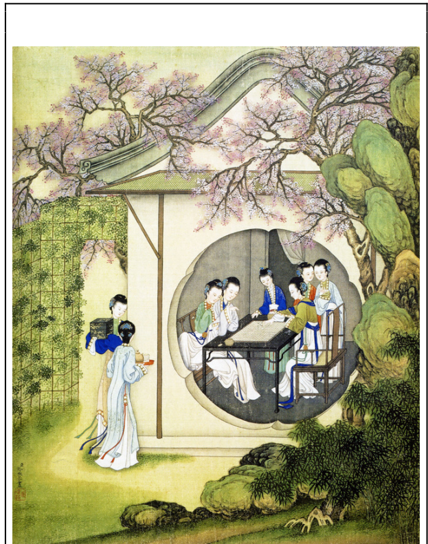
Leng Mei, Leaves 24 and 25 from Collected Album of Paintings, 1677-1742. National Palace Museum, Taipei;

Likewise when they directly described Europeans. “Biographies” 213 in fascicle 325 of The History of the Ming (1368-1644) characterizes the Dutch as having “deep set eyes and a long nose, with the hair, eyebrows, and beard equally red.” Seemingly an objective depiction of physical characteristics, the passage employs the words “deep set eyes and long noses” with a clearly derogatory nuance. The term “red hair” ( hongmao ) as a disparaging alias for Westerners began to be used around then. Likewise, “red hair, jasper eyes” ( hongmao biyan ) was a negative expression. As in Tang China, red hair (or gold hair) and blue eyes were directly connected to the image of wild animals. Such a view was finally reversed in modern times.