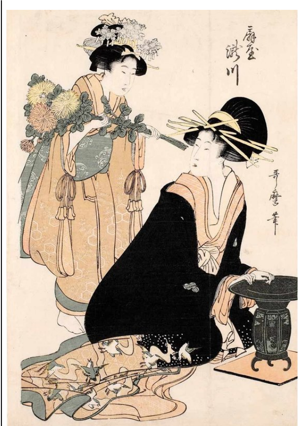
Kitagawa Utamaro, The Courtesan Takikawa of the Ogiya Brothel Accompanied by her Kamuro, 1801.

The absence of universal standards for physical beauty was recognized early on along with the discovery of "the intercultural." Ever since Darwin stated, "It is certainly not true that there is in the mind of man any universal standard of beauty with respect to the human body," 1 many researchers have made the same point. Claude Lévi-Strauss, who observed the body drawings of the Caduveo tribe in Brazil and described them in Tristes Tropiques (1955), conjectured as to why many men belonging to other tribes came to settle and marry Caduveo women at Nalike: "Perhaps the facial and body paintings explain the attraction; at all events, they strengthen and symbolize it. The delicate and subtle markings, which are as sensitive as the lines of the face, and sometimes accentuate them, sometimes run counter to them, make the women delightfully alluring." 2 When he wrote this, the aesthetics that greatly differed from Western sense of beauty did not shock his readers. In their daily lives, however, most people still believe that essential physical beauty exists universally.