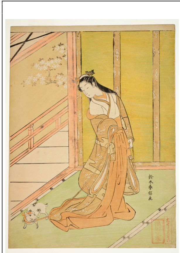
Suzuki Harunobu, Princess Sannomiya (Third Princess from the Tale of Genji ), circa 1766. Honolulu Museum of Art; WikiCommons .

ugly not only because they were regarded as “outsiders” but because they were “people of lower standing” than the Chinese.