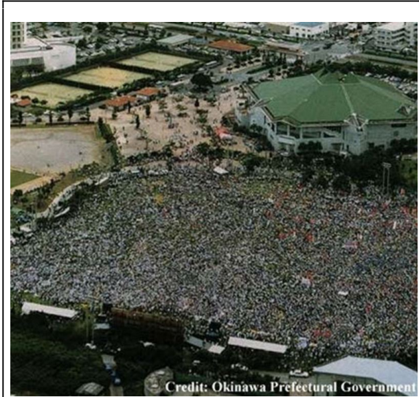
October 25, 1995 demonstration

Their protest rallies in the late 1960s featured marches and sit-ins reminiscent of civil rights demonstrations in the U.S. a few years earlier. Sometimes demonstrators gathered outside the gate to Camp Schwab in Henoko, handing out leaflets in Japanese and English. The military command warned troops not to take the leaflets, and also advised against going to Nago, said to be “full of Communists.” Few soldiers went there anyway, since it had no G.I. bars. In those days, Nago was a picturesque fishing and farming town with flower-filled gardens and tree-lined streets. One-man sabani fishing boats drifted on the bay where sunsets were particularly beautiful with a sky of deep red glowing above puffy white clouds. Residents raised pigs, goats, and chickens, along with sugar cane. Rows of terraced rice fields covered the hills surrounding the town.