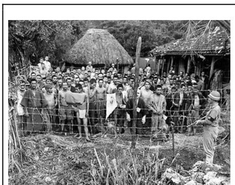
Marines guard soldiers, civilians after Battle of Okinawa