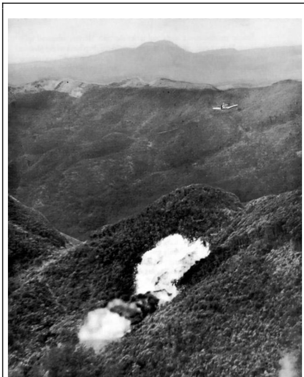
Firebombing in Northern Okinawa

Fighting in the Battle of Okinawa (late March to late June, 1945) was sporadic around Henoko, and in the northeastern part of the main island generally. Still, Henoko residents died in artillery fire and bombing raids, which forced many to abandon their homes for refuge in nearby hills and forests.