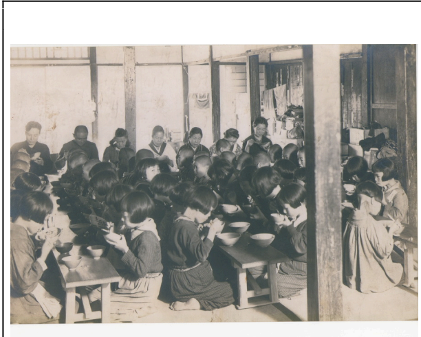
Children sheltered at Kouseiji Temple, Nagano Prefecture, during the war.

and the New Year. This caused adults to say, “So after all, the country is better for children, food-wise.” By the time my friends and I arrived, however, food was scarce even in the countryside.