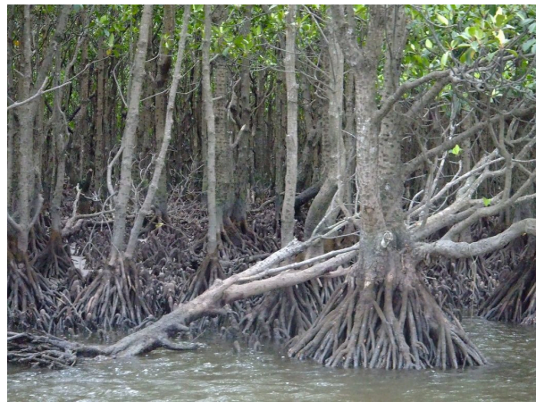
Mangroves on the Nakama River, Iriomote.