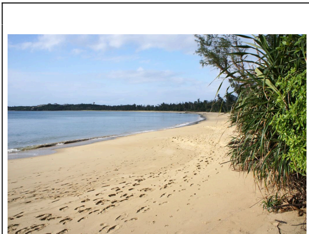
Tudumari-no-hama (Tsukigahama Beach).