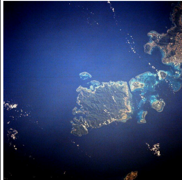
Iriomote Island from Space, 2005.